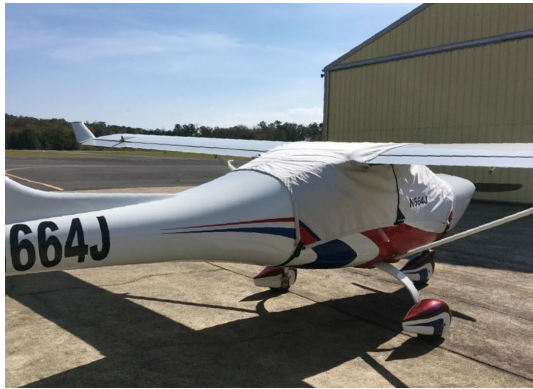
Jabiru J230-SP Canopy Cover, Over-Top Style

This cover type is made from Silver Acrylic Sunbrella canvas and is 100% lined with a soft and smooth microfiber. Bruce's Custom Covers developed this material combination especially for aircraft protection. The outer material is medium weight and treated for water resistance, UV resistance and anti-static buildup. The inner lining is a very soft and smooth microfiber to prevent scratching. The material is very reflective, and tests show that the cabin interior temperature can be reduced to near-ambient temperature on the hottest of days. It is water, ice and snow repellent, yet breathable to allow moisture to escape from between the cover and the aircraft surface.