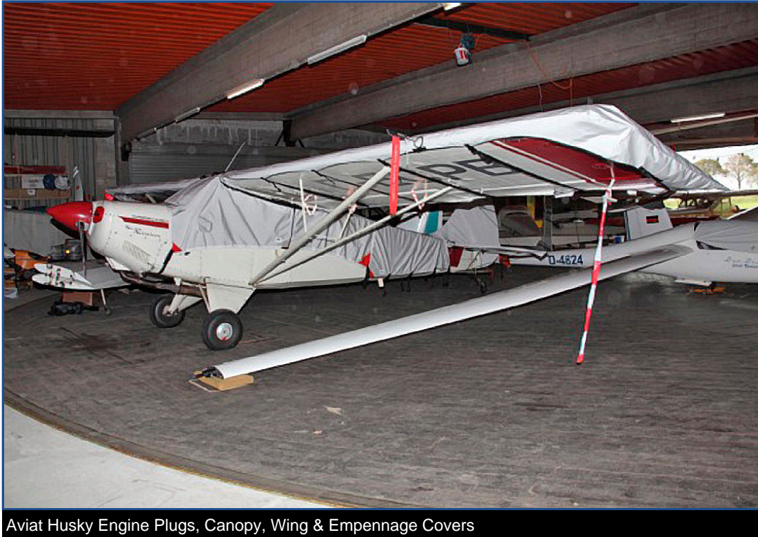
Aviat Husky Engine Plugs, Canopy, Wing &amp; Empennage Covers