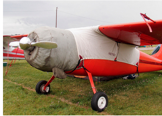
Cessna 195 Over-Top Canopy Cover & Engine Cover