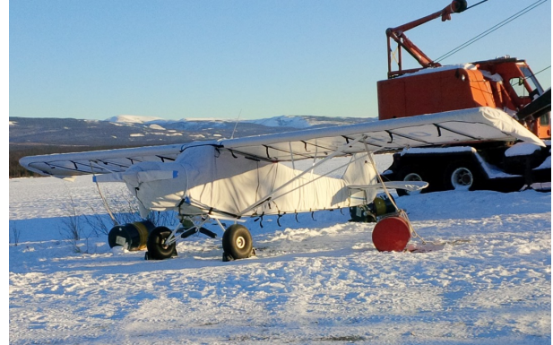
Piper Super Cub Complete Cover Set