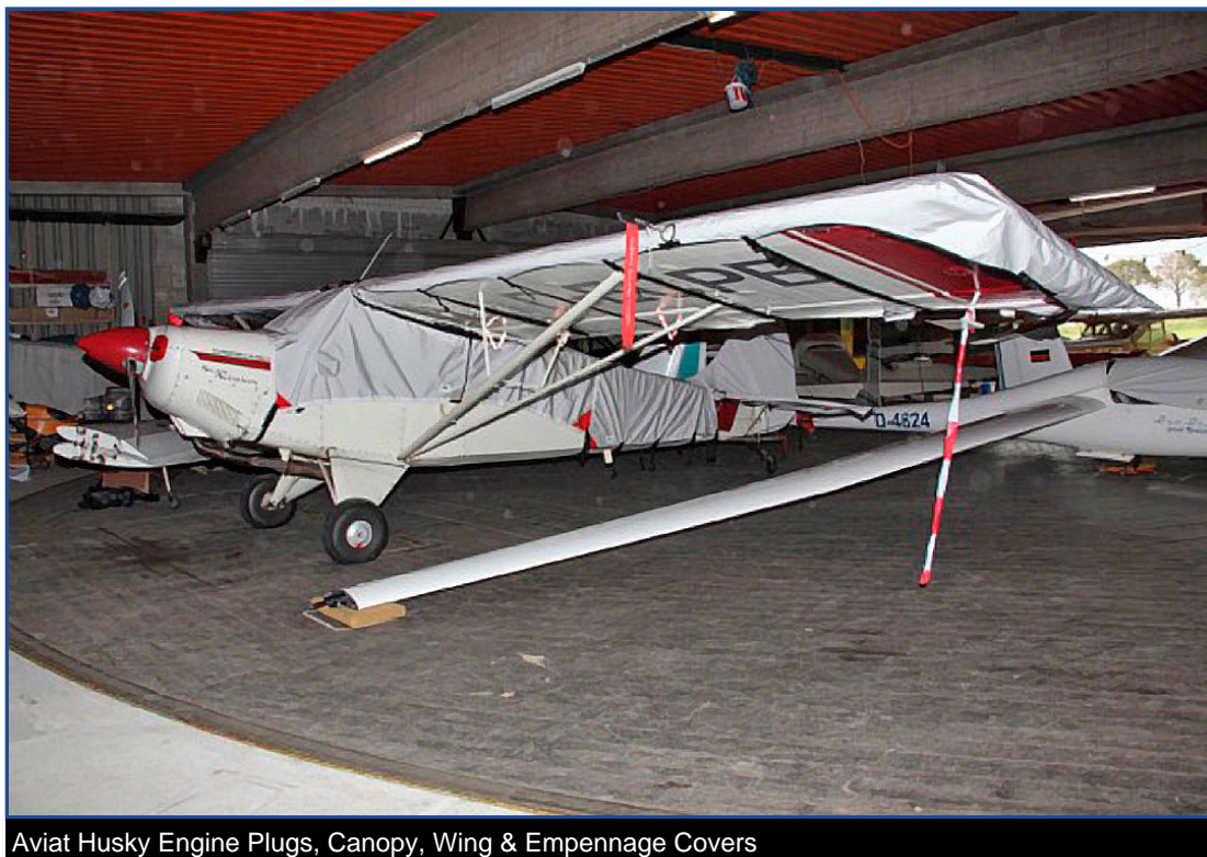
Aviat Husky Engine Plugs, Canopy, Wing &amp; Empennage Covers