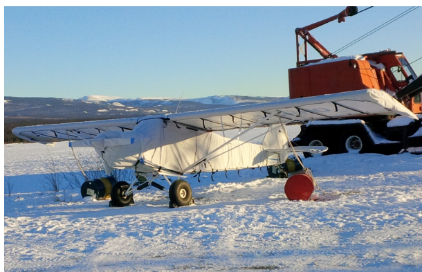
Piper Super Cub Complete Cover Set

WINTER USE MATERIAL - Made with Solution-Dyed Polyester fabric, this option is intended for seasonal use to aid in deicing, rain mitigation, or for occasional travel. The material is lighter and more compact, but more susceptible to UV damage and may have a shorter useful life if used continuously outside than the all-year use material.