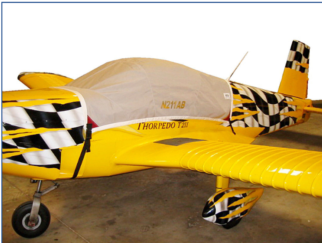
Indus Thorpedo Canopy Cover