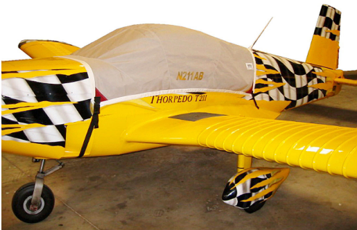
Indus Thorpedo Canopy Cover