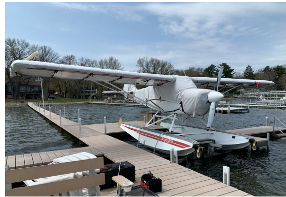
Aviat Husky Canopy, Engine, Wing, Empennage Covers