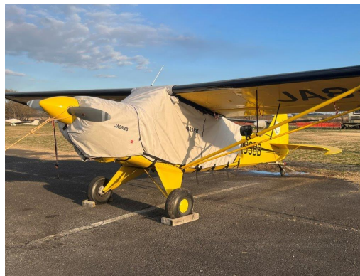
Aviat Husky Extended Canopy Cover, Engine Cover