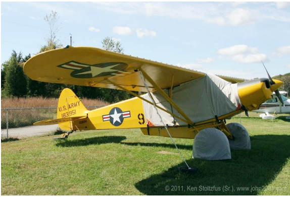
Piper L-21b Extended Canopy Cover, Tire Covers