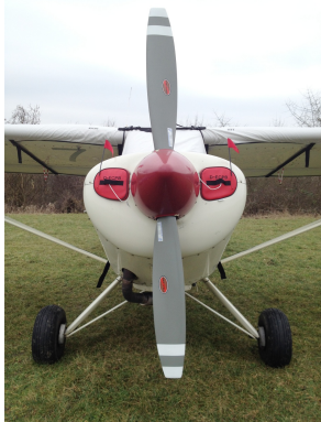
Aviat Husky Engine Plugs, Wing Covers

Engine Inlet Plugs are custom fit for your Aviat (Christen) Husky intakes, made with heavy-duty vinyl material, and stuffed with a single block of sculpted urethane foam. Each plug has a zipper that allows the foam to be removed and dried if necessary. Engine plugs have warning flags that are visible from the cockpit or 'remove before flight' streamers sewn onto the face of the plugs. Most plugs are imprinted with the aircraft registration number in black for an extra charge. Storage bag NOT included. Engine plugs may be inserted after flight when the engine is still warm. Engine Inlet Plugs are commonly referred to as Cowl Plugs, Intake Plugs, Cowl Blocks, Engine Blocks, and Engine Bungs.