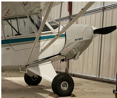
Aviat Husky A-1A Insulated Engine Cover

This cover type is made from Silver Acrylic Sunbrella canvas and is 100% lined with a soft and smooth microfiber. Bruce's Custom Covers developed this material combination especially for aircraft protection. The outer material is medium weight and treated for water resistance, UV resistance and anti-static buildup. The inner lining is a very soft and smooth microfiber to prevent scratching. The material is very reflective, and tests show that the cabin interior temperature can be reduced to near-ambient temperature on the hottest of days. It is water, ice and snow repellent, yet breathable to allow moisture to escape from between the cover and the aircraft surface.