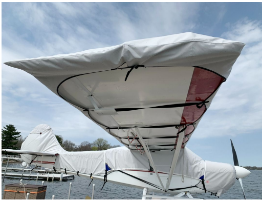
Aviat Husky Canopy, Engine, Wing, Empennage Covers

This cover type is made from Silver Acrylic Sunbrella canvas and is 100% lined with a soft and smooth microfiber. Bruce's Custom Covers developed this material combination especially for aircraft protection. The outer material is medium weight and treated for water resistance, UV resistance and anti-static buildup. The inner lining is a very soft and smooth microfiber to prevent scratching. The material is very reflective, and tests show that the cabin interior temperature can be reduced to near-ambient temperature on the hottest of days. It is water, ice and snow repellent, yet breathable to allow moisture to escape from between the cover and the aircraft surface.