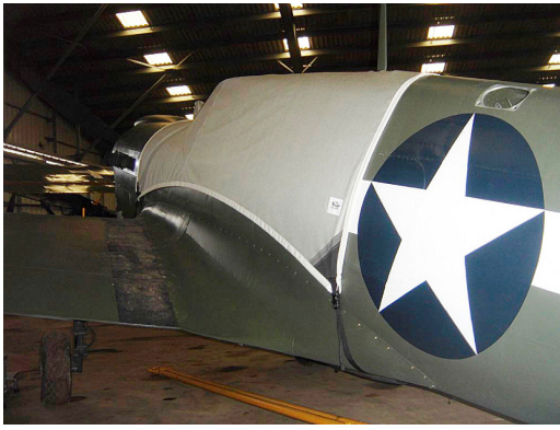
P40 Canopy Cover