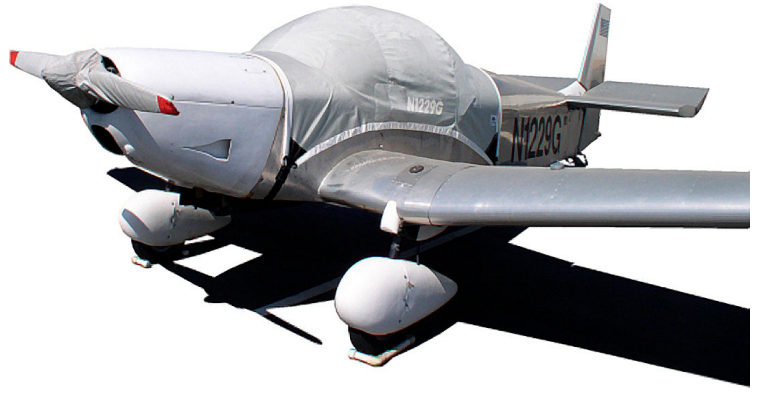
Zenith CH601 Canopy Cover & Prop Cover