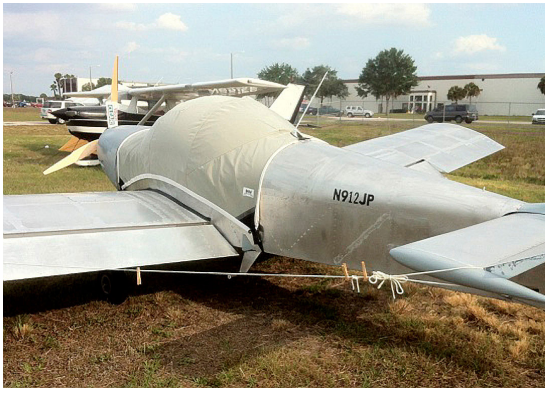
Zenith 601 XL Canopy Cover