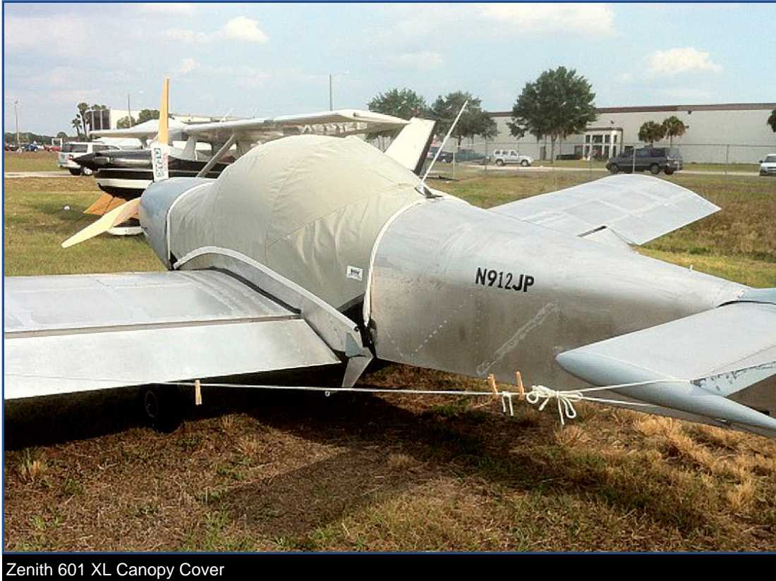
Zenith 601 XL Canopy Cover