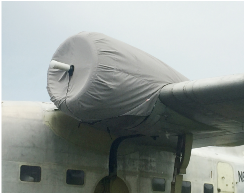
Grumman Albatross Engine Covers

This cover type is made from Silver Acrylic Sunbrella canvas and is 100% lined with a soft and smooth microfiber. Bruce's Custom Covers developed this material combination especially for aircraft protection. The outer material is medium weight and treated for water resistance, UV resistance and anti-static buildup. The inner lining is a very soft and smooth microfiber to prevent scratching. The material is very reflective, and tests show that the cabin interior temperature can be reduced to near-ambient temperature on the hottest of days. It is water, ice and snow repellent, yet breathable to allow moisture to escape from between the cover and the aircraft surface.