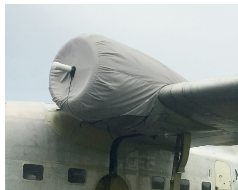
Grumman Albatross Engine Covers