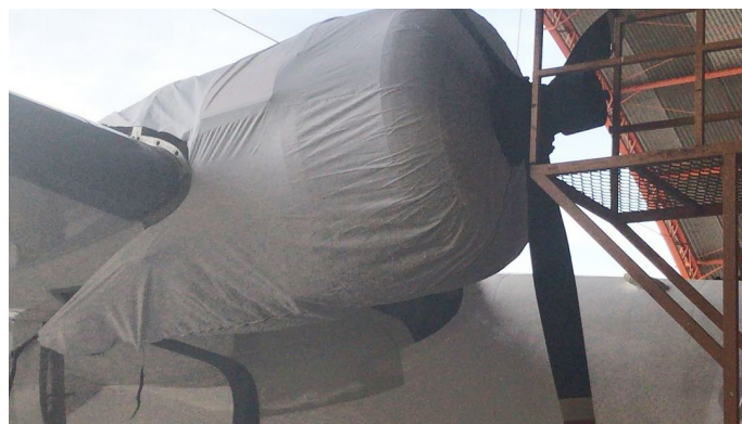
Grumman HU-16 Albatross Engine Cover (test fit cover)