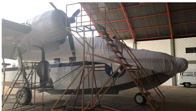
Grumman HU-16 Albatross Cockpit/Nose Cover and Engine Cover(test fit covers)

This cover type is made from Silver Acrylic Sunbrella canvas and is 100% lined with a soft and smooth microfiber. Bruce's Custom Covers developed this material combination especially for aircraft protection. The outer material is medium weight and treated for water resistance, UV resistance and anti-static buildup. The inner lining is a very soft and smooth microfiber to prevent scratching. The material is very reflective, and tests show that the cabin interior temperature can be reduced to near-ambient temperature on the hottest of days. It is water, ice and snow repellent, yet breathable to allow moisture to escape from between the cover and the aircraft surface.