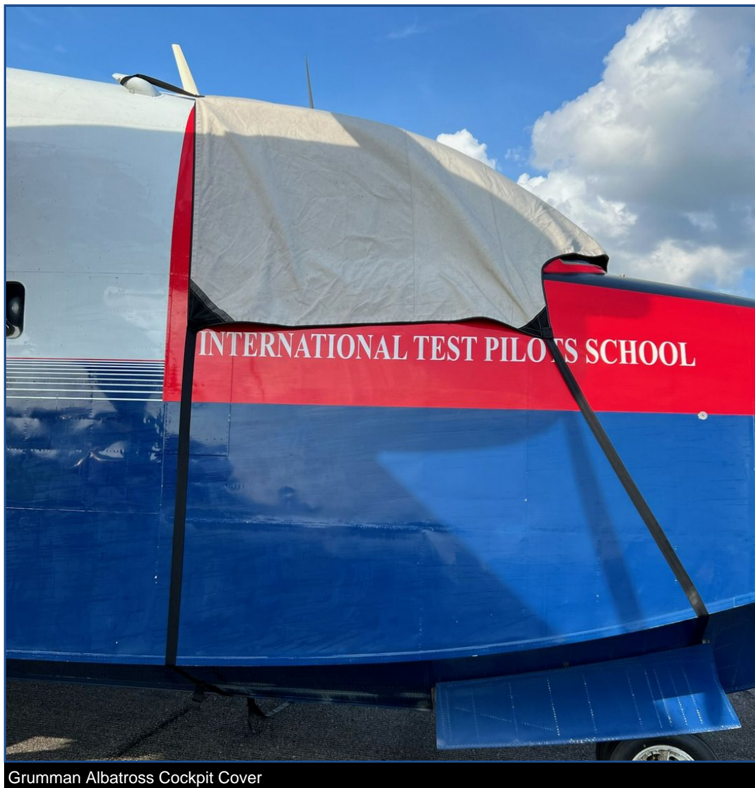
Grumman Albatross Cockpit Cover