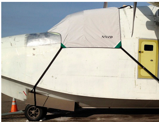
Grumman HU-16 Albatross Canopy Cover

This cover type is made from Silver Acrylic Sunbrella canvas and is 100% lined with a soft and smooth microfiber. Bruce's Custom Covers developed this material combination especially for aircraft protection. The outer material is medium weight and treated for water resistance, UV resistance and anti-static buildup. The inner lining is a very soft and smooth microfiber to prevent scratching. The material is very reflective, and tests show that the cabin interior temperature can be reduced to near-ambient temperature on the hottest of days. It is water, ice and snow repellent, yet breathable to allow moisture to escape from between the cover and the aircraft surface.