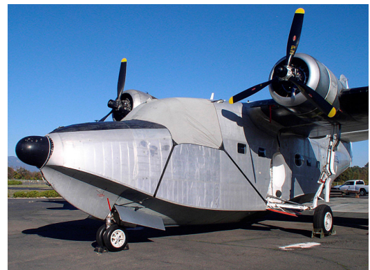
Canopy Cover for the Grumman HU-16 Albatross