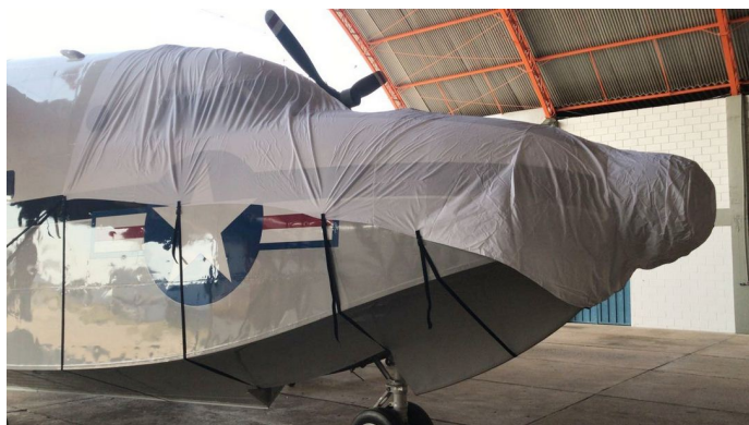
Grumman HU-16 Albatross Cockpit/Nose Cover (test fit cover)

This cover type is made from Silver Acrylic Sunbrella canvas and is 100% lined with a soft and smooth microfiber. Bruce's Custom Covers developed this material combination especially for aircraft protection. The outer material is medium weight and treated for water resistance, UV resistance and anti-static buildup. The inner lining is a very soft and smooth microfiber to prevent scratching. The material is very reflective, and tests show that the cabin interior temperature can be reduced to near-ambient temperature on the hottest of days. It is water, ice and snow repellent, yet breathable to allow moisture to escape from between the cover and the aircraft surface.