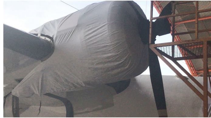
Grumman HU-16 Albatross Engine Cover (test fit cover)