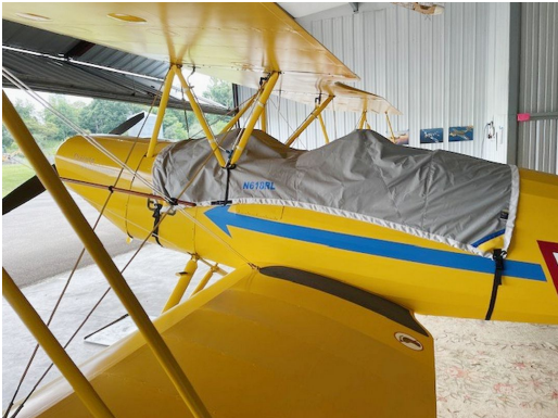
HATZ CB-1 Travel Cover, Light Weight Canopy Cover

This cover type is made from Silver Acrylic Sunbrella canvas and is 100% lined with a soft and smooth microfiber. Bruce's Custom Covers developed this material combination especially for aircraft protection. The outer material is medium weight and treated for water resistance, UV resistance and anti-static buildup. The inner lining is a very soft and smooth microfiber to prevent scratching. The material is very reflective, and tests show that the cabin interior temperature can be reduced to near-ambient temperature on the hottest of days. It is water, ice and snow repellent, yet breathable to allow moisture to escape from between the cover and the aircraft surface.