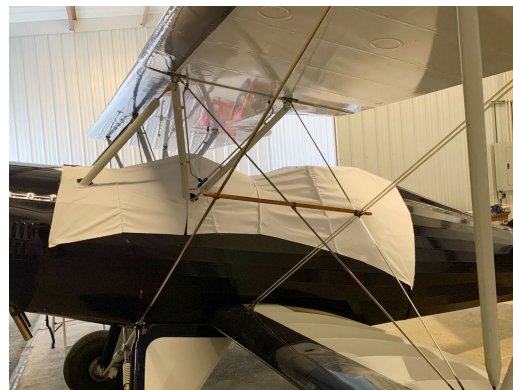
Hatz Biplane Canopy Cover, test fit cover