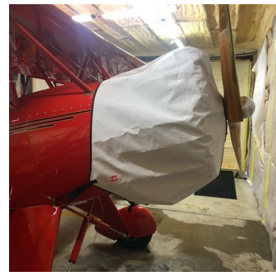
Hatz Biplane CB-1 Engine Cover