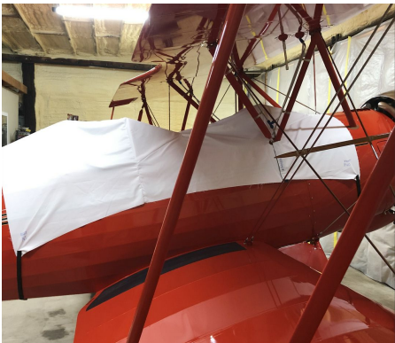
Hatz Biplane Canopy Cover, test fit cover