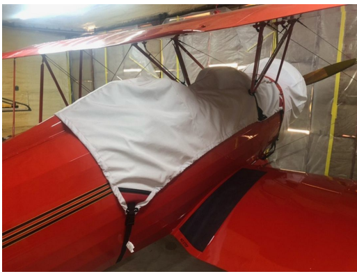
Hatz CB-1 Biplane Canopy & Engine Covers