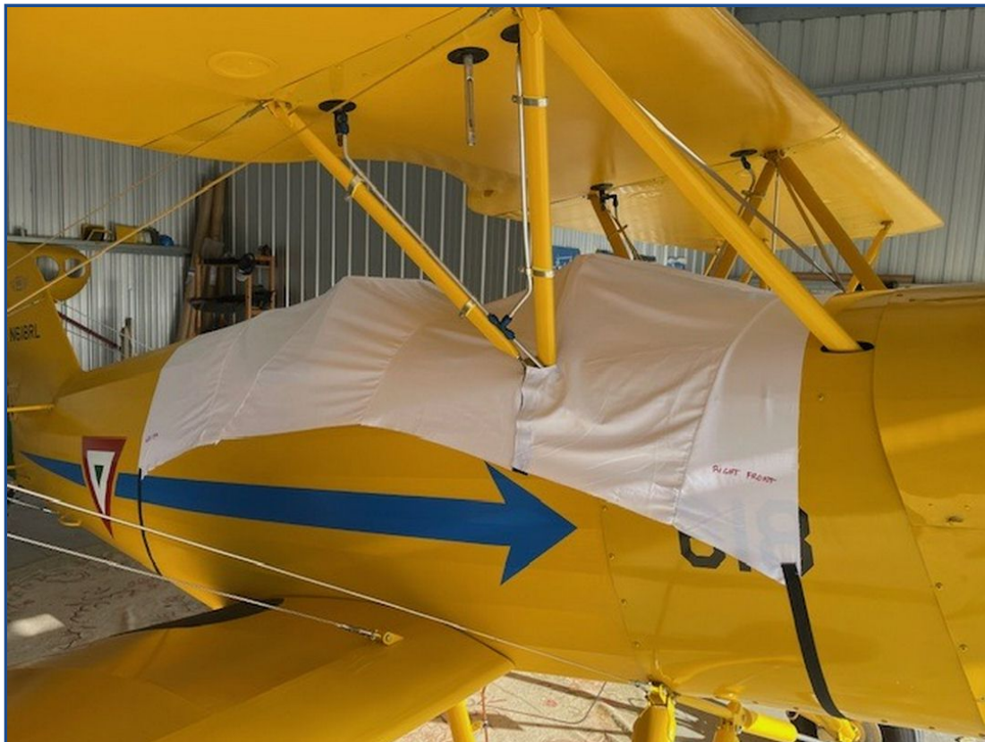
Hatz CB-1 Canopy Cover, test fit