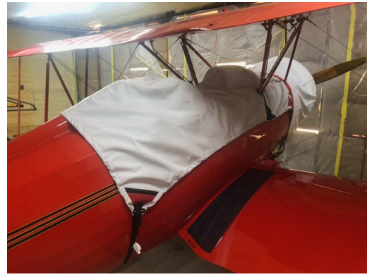
Hatz CB-1 Biplane Canopy & Engine Covers