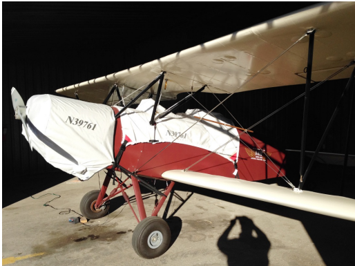
Hatz Biplane Canopy and Engine Covers

This cover type is made from Silver Acrylic Sunbrella canvas and is 100% lined with a soft and smooth microfiber. Bruce's Custom Covers developed this material combination especially for aircraft protection. The outer material is medium weight and treated for water resistance, UV resistance and anti-static buildup. The inner lining is a very soft and smooth microfiber to prevent scratching. The material is very reflective, and tests show that the cabin interior temperature can be reduced to near-ambient temperature on the hottest of days. It is water, ice and snow repellent, yet breathable to allow moisture to escape from between the cover and the aircraft surface.