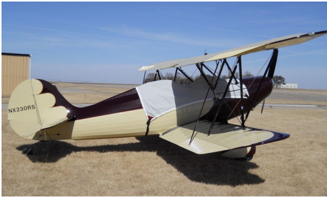
Hatz Biplane Canopy Cover