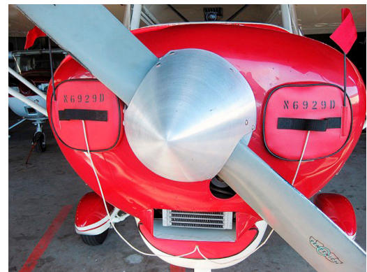
Piper PA-22-150 Engine Inlet Plugs (set of 3)