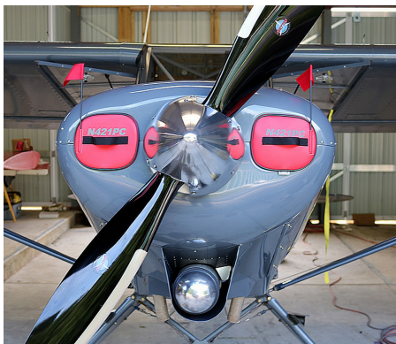
Piper PA-18 Super Cub Engine Inlet Plugs

Engine Inlet Plugs are custom fit for your Hatz Biplane CB-1 intakes, made with heavy-duty vinyl material, and stuffed with a single block of sculpted urethane foam. Each plug has a zipper that allows the foam to be removed and dried if necessary. Engine plugs have warning flags that are visible from the cockpit or 'remove before flight' streamers sewn onto the face of the plugs. Most plugs are imprinted with the aircraft registration number in black for an extra charge. Storage bag NOT included. Engine plugs may be inserted after flight when the engine is still warm. Engine Inlet Plugs are commonly referred to as Cowl Plugs, Intake Plugs, Cowl Blocks, Engine Blocks, and Engine Bungs.