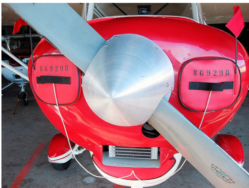
Piper PA-22-150 Engine Inlet Plugs (set of 3)

Engine Inlet Plugs are custom fit for your Hatz Biplane CB-1 intakes, made with heavy-duty vinyl material, and stuffed with a single block of sculpted urethane foam. Each plug has a zipper that allows the foam to be removed and dried if necessary. Engine plugs have warning flags that are visible from the cockpit or 'remove before flight' streamers sewn onto the face of the plugs. Most plugs are imprinted with the aircraft registration number in black for an extra charge. Storage bag NOT included. Engine plugs may be inserted after flight when the engine is still warm. Engine Inlet Plugs are commonly referred to as Cowl Plugs, Intake Plugs, Cowl Blocks, Engine Blocks, and Engine Bungs.