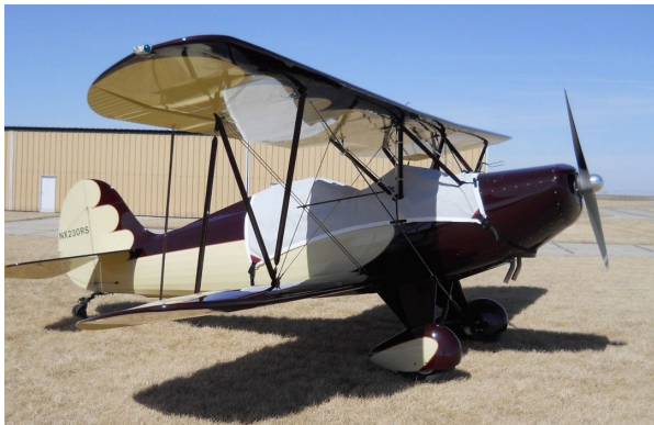
Hatz Biplane Canopy Cover

This cover type is made from Silver Acrylic Sunbrella canvas and is 100% lined with a soft and smooth microfiber. Bruce's Custom Covers developed this material combination especially for aircraft protection. The outer material is medium weight and treated for water resistance, UV resistance and anti-static buildup. The inner lining is a very soft and smooth microfiber to prevent scratching. The material is very reflective, and tests show that the cabin interior temperature can be reduced to near-ambient temperature on the hottest of days. It is water, ice and snow repellent, yet breathable to allow moisture to escape from between the cover and the aircraft surface.