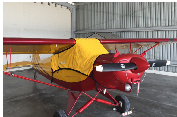
Piper Super Cub Canopy Cover, Engine Plugs