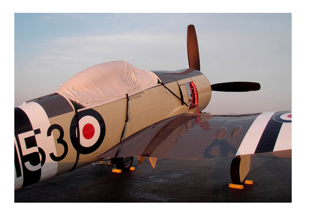
Sea Fury Canopy Cover & Exhaust Plugs