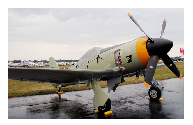
Sea Fury Canopy Cover & Exhaust Plugs