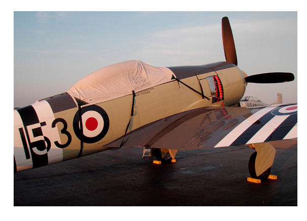
Sea Fury Canopy Cover & Exhaust Plugs