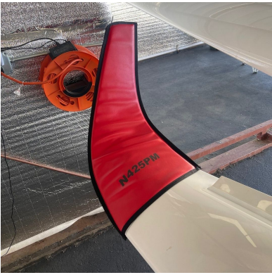
Stemme S-10 & S-12 Wingtip Pads