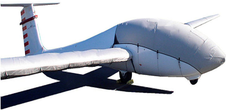
Grob 103 Canopy/Nose Cover and Wing Covers