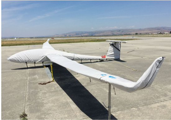
Schemp-Hirth Discus 2B Full Cover Set

This cover type is made from Silver Acrylic Sunbrella canvas and is 100% lined with a soft and smooth microfiber. Bruce's Custom Covers developed this material combination especially for aircraft protection. The outer material is medium weight and treated for water resistance, UV resistance and anti-static buildup. The inner lining is a very soft and smooth microfiber to prevent scratching. The material is very reflective, and tests show that the cabin interior temperature can be reduced to near-ambient temperature on the hottest of days. It is water, ice and snow repellent, yet breathable to allow moisture to escape from between the cover and the aircraft surface.