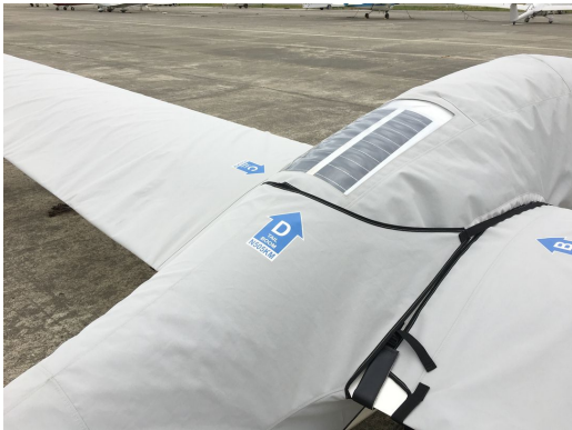
DG-505 Full Cover Set