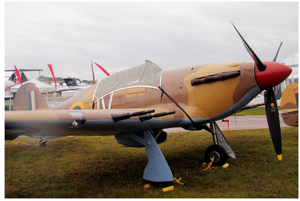
Hawker Hurricane Canopy Cover