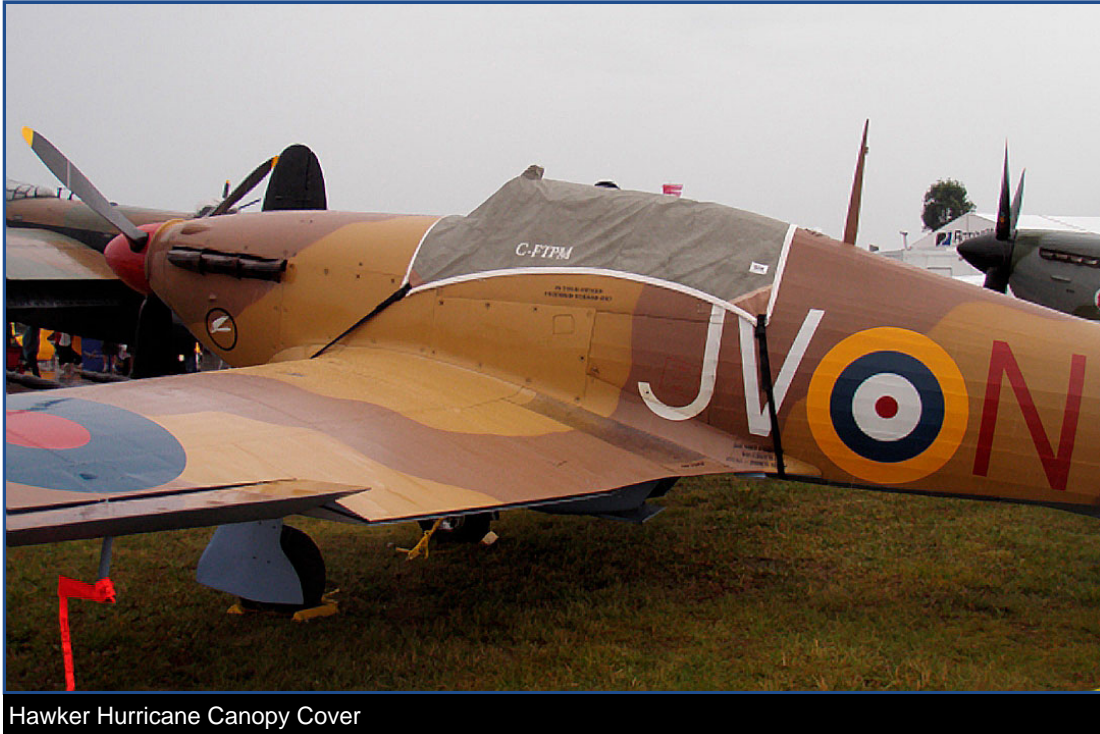
Hawker Hurricane Canopy Cover