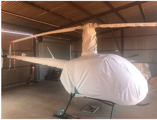
Robinson R-22 Full Cover Set