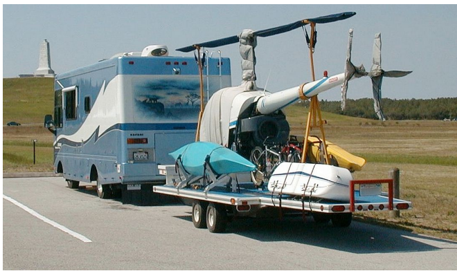
Robinson R-22 Bubble, Rotor Mast, Blades, Tail Rotor & Stabilizer Covers