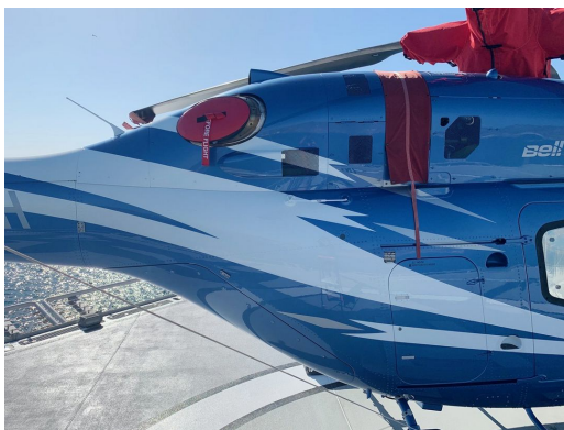
Bell 429 Exhaust Plug, Rotor Mast Cover

The Engine Exhaust Plugs are custom fit for your Eagle R&D Helicycle exhaust openings, made with heavy-duty vinyl material, and stuffed with a single block of sculpted urethane foam. Exhaust plugs have 'Remove Before Flight' streamers sewn onto the face of the plugs. Exhaust plugs may be inserted soon after flight when the engine is still warm. Engine Inlet Plugs are commonly referred to as Cowl Plugs, Intake Plugs, Cowl Blocks, Engine Blocks, and Engine Bungs.