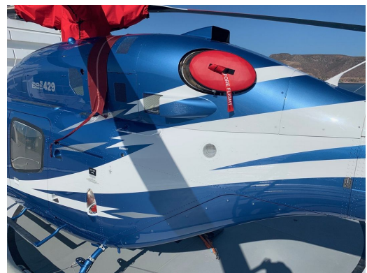
Bell 429 Exhaust Plug