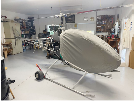
Eagle Helicycle Bubble Cover

Travel Covers are made with Silver Solution-Dyed Polyester fabric and fully lined over the entire cover. The material is lightweight and more compact for easy stowage in the aircraft. The polyester material is water resistant, but only intended for occasional use outside. We also have an ultra lightweight material available for fitted hangar dust covers. For daily outdoor use, the non-travel Sunbrella Cover is the best choice.