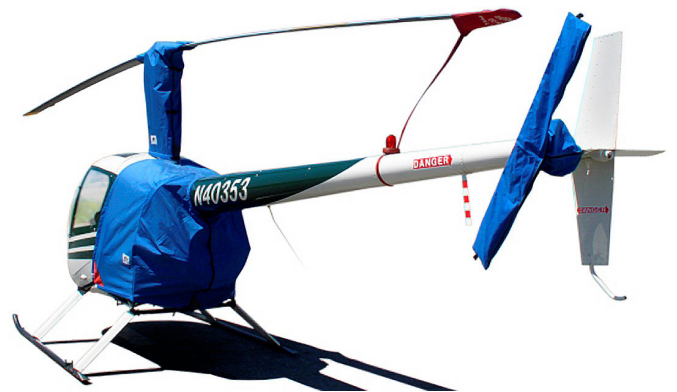
Robinson R-22 Engine, Rotor Mast & Tail Rotor Covers, with Blade Tie-down