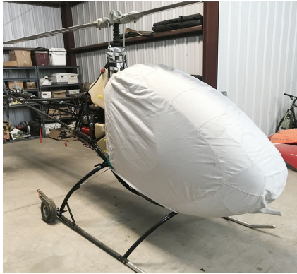
Helicycle Bubble Cover

This cover type is made from Silver Acrylic Sunbrella canvas and is 100% lined with a soft and smooth microfiber. Bruce's Custom Covers developed this material combination especially for aircraft protection. The outer material is medium weight and treated for water resistance, UV resistance and anti-static buildup. The inner lining is a very soft and smooth microfiber to prevent scratching. The material is very reflective, and tests show that the cabin interior temperature can be reduced to near-ambient temperature on the hottest of days. It is water, ice and snow repellent, yet breathable to allow moisture to escape from between the cover and the aircraft surface.