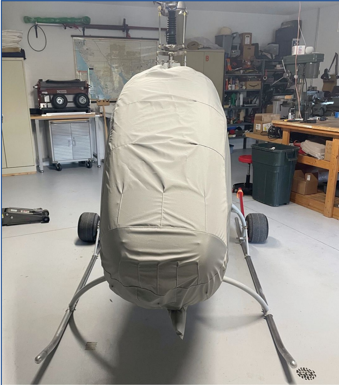
Eagle Helicycle Bubble Cover