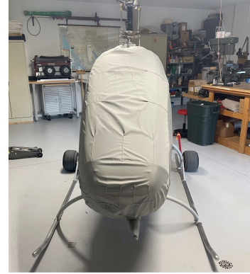
Eagle Helicycle Bubble Cover