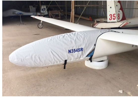
HBV-Diamant 16.5 Canopy/Nose Cover