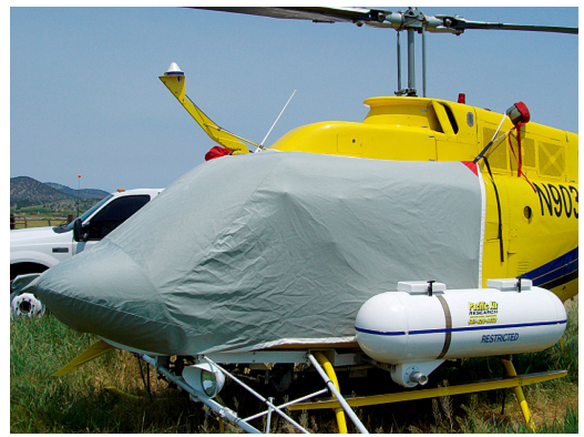
206B Bubble Cover