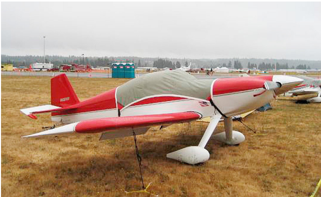
Harmon Rocket Canopy Cover & Engine Inlet Plugs