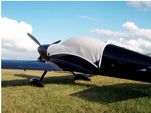
Harmon Rocket Canopy Cover

Travel Covers are made with Silver Solution-Dyed Polyester fabric and only lined over the windshield to save weight. The material is lightweight and more compact for easy stowage in the aircraft. The polyester material is water resistant, but only intended for occasional use outside. We also have an ultra lightweight material available for fitted hangar dust covers. For daily outdoor use, the non-travel Sunbrella Cover is the best choice.