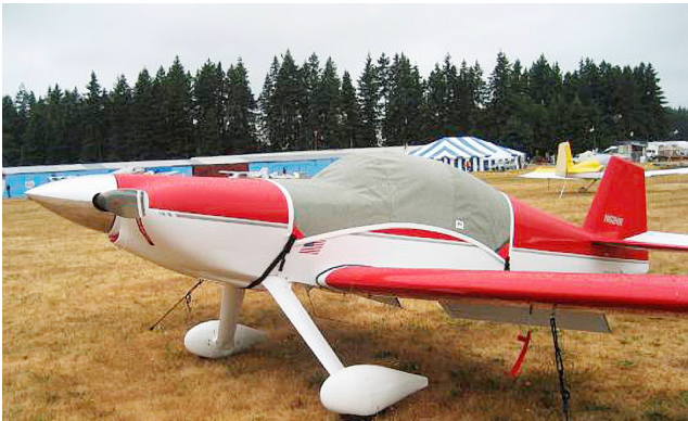
Harmon Rocket Canopy Cover & Engine Inlet Plugs