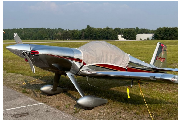
Harmon Rocket Travel Light Weight Canopy Cover Std Windshield