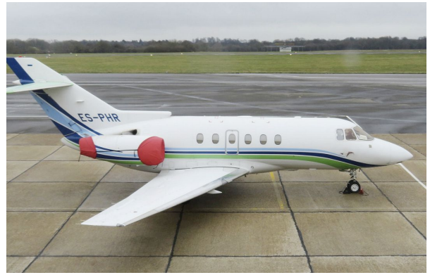
Hawker 750 Tri-Fold Engine Covers.