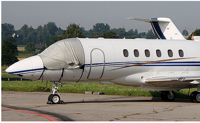
Hawker 800 Cockpit Cover