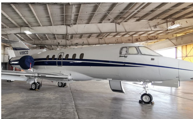
Hawker 750 HeatShields & Engine Covers

Cockpit Heatshields are interior sunshades for the aircraft's cockpit. The product is a unique composite of closed-cell foam with a silver mylar finish. The semi-rigid design is stiff enough to stand inside the window framing. The set folds up flat and is easily stored in the included storage sleeve. Some designs may require velcro and suction cups. Our Heatshields for jets are offered white side out because some aircraft manufacturers have issued advisories against reflective window inserts due to potential heat damage. A Heatshield is an excellent short-term remedy for cockpit overheating, but an external fabric cover is more effective for long-term protection.