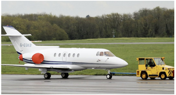
Hawker 800 Tri-Fold Engine Covers.