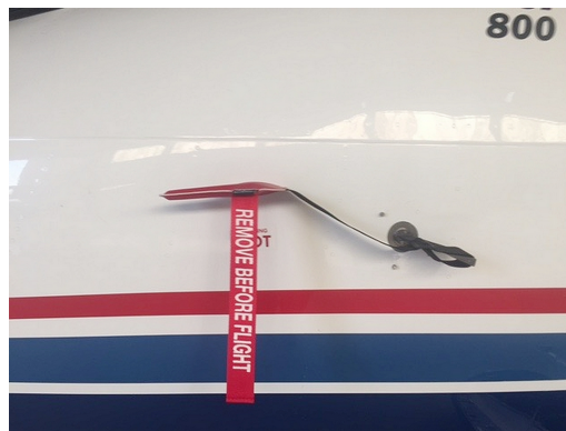
Hawker Beechcraft 800, 800XP, 850XP Pitot Covers With Aoa Straps

The Engine Inlet Plugs are custom fit for your British Aerospace Hawker 700 intakes, made with heavy-duty vinyl material, and stuffed with a single block of sculpted urethane foam. Each plug has a zipper that allows the foam to be removed and dried if necessary. Engine plugs have 'remove before flight' streamers sewn onto the face of the plugs. Most plugs are imprinted with the aircraft registration number in black for an extra charge. Storage bag NOT included. Engine plugs may be inserted after flight when the engine is still warm. Engine Inlet Plugs are commonly referred to as Cowl Plugs, Intake Plugs, Cowl Blocks, Engine Blocks, and Engine Bungs.