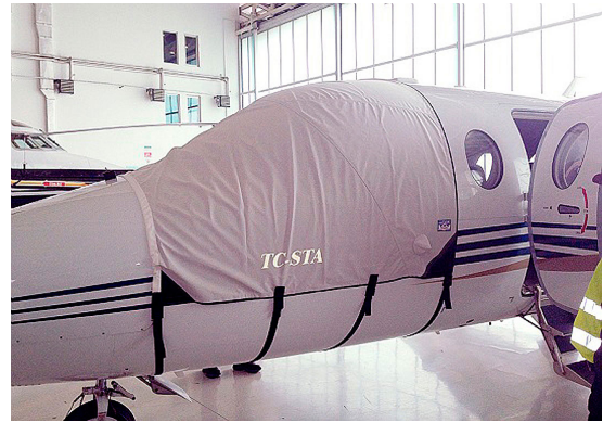
Beechjet 400A Cockpit Cover