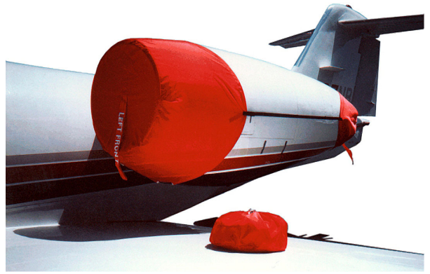
Lear 35 Engine Covers