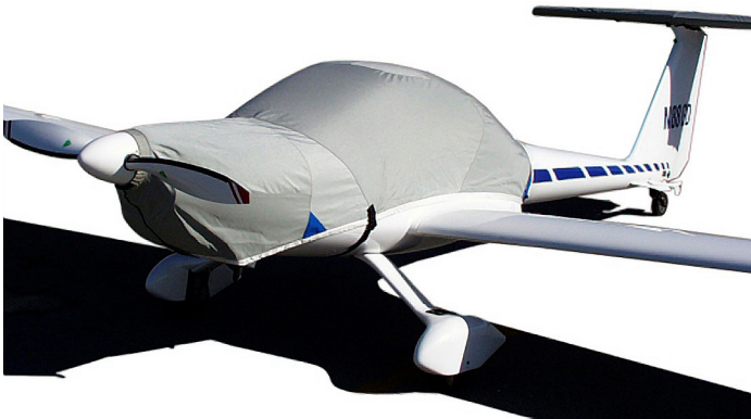
Diamond DA-20 Canopy/Engine Cover

The Dimona H36 Canopy/Engine Cover is a one-piece cover (100% lined with microfiber) that is a combination of the Canopy Cover and Engine Cover. This cover will enclose the engine cowl and will extend aft to cover all of the windows. This cover type is made from Silver Acrylic Sunbrella canvas and is 100% lined with a soft and smooth microfiber. Bruce's Custom Covers developed this material combination especially for aircraft protection. The outer material is medium weight and treated for water resistance, UV resistance and anti-static buildup. The inner lining is a very soft and smooth microfiber to prevent scratching. The material is very reflective, and tests show that the cabin interior temperature can be reduced to near-ambient temperature on the hottest of days. It is water, ice and snow repellent, yet breathable to allow moisture to escape from between the cover and the aircraft surface.