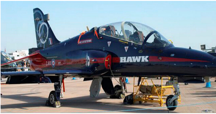
Hawk 200 Engine Intake Plugs