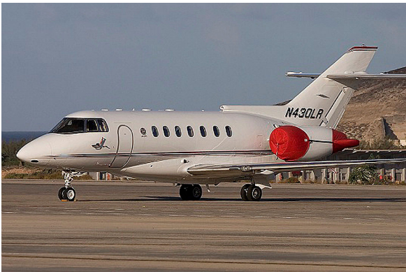
Hawker 1000 Engine Cover Set