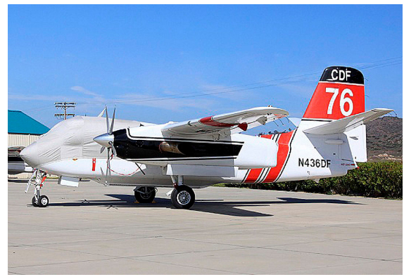
Grumman Tracker (turbine model) Canopy/Nose Cover