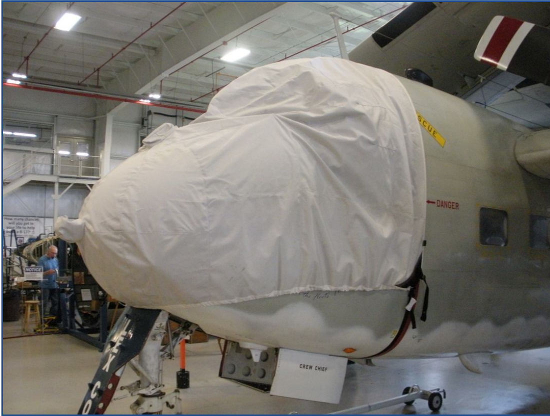
Grumman Tracker Canopy/Nose Cover