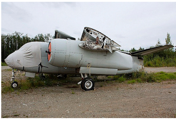
Grumman Tracker Canopy/Nose Cover