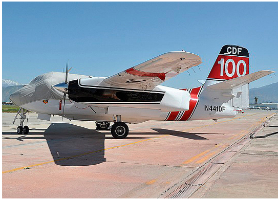
Grumman Tracker (turbine model) Canopy/Nose Cover