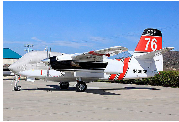
Grumman Tracker (turbine model) Canopy/Nose Cover