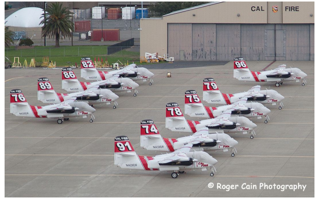
Grumman S-2 Tracker Canopy/Nose Cover