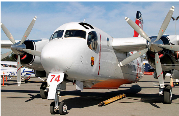
Grumman Tracker Engine Inlet Plugs

Engine Inlet Plugs are custom fit for your Grumman S-2 Tracker intakes, made with heavy-duty vinyl material, and stuffed with a single block of sculpted urethane foam. Each plug has a zipper that allows the foam to be removed and dried if necessary. Engine plugs have warning flags that are visible from the cockpit or 'remove before flight' streamers sewn onto the face of the plugs. Most plugs are imprinted with the aircraft registration number in black for an extra charge. Storage bag NOT included. Engine plugs may be inserted after flight when the engine is still warm. Engine Inlet Plugs are commonly referred to as Cowl Plugs, Intake Plugs, Cowl Blocks, Engine Blocks, and Engine Bungs.