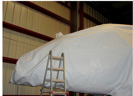
NSN 1730-01-600-4557, COVER,AIRCRAFT SHIP & NSN 1730-01-600-6757, COVER,AIRCRAFTSHIP

GR-7/9 FULL FUSELAGE COVER , NSN's: 1730-01-600-4557 & GR-7/9 FULL FUSELAGE COVER , NSN's: 1730-01-600-4557 & 1730-01-600-6757, dual seat