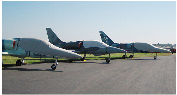
L-39 Canopy Cover, Canopy/Nose Covers, Plugs