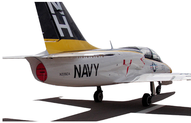
L-39 Exhaust Plug