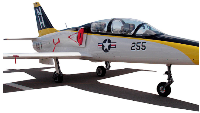
L-39 Intake Plugs