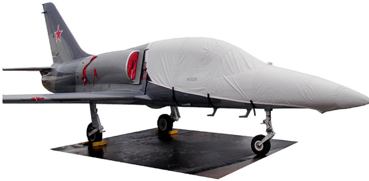
L-39 Canopy/Nose Cover & Plugs

Covers developed this material combination especially for aircraft protection. The outer material is medium weight and treated for water resistance, UV resistance and anti-static buildup. The inner lining is a very soft and smooth microfiber to prevent scratching. The material is very reflective, and tests show that the cabin interior temperature can be reduced to near-ambient temperature on the hottest of days. It is water, ice and snow repellent, yet breathable to allow moisture to escape from between the cover and the aircraft surface.