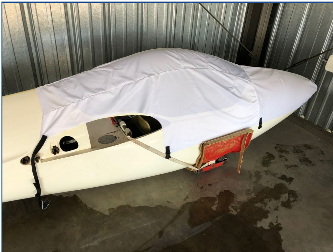
Glasflugel H-301B Libelle Canopy/Nose Cover, test fit cover