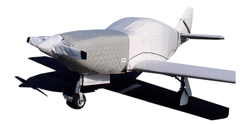
Glasair I Insulated Engine Cover, Prop Cover, Etc.