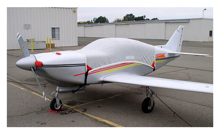
Glasair II/III Canopy Cover & Plugs

Engine Inlet Plugs are custom fit for your Glasair Aviation Glasair II & III intakes, made with heavy-duty vinyl material, and stuffed with a single block of sculpted urethane foam. Each plug has a zipper that allows the foam to be removed and dried if necessary. Engine plugs have warning flags that are visible from the cockpit or 'remove before flight' streamers sewn onto the face of the plugs. Most plugs are imprinted with the aircraft registration number in black for an extra charge. Storage bag NOT included. Engine plugs may be inserted after flight when the engine is still warm. Engine Inlet Plugs are commonly referred to as Cowl Plugs, Intake Plugs, Cowl Blocks, Engine Blocks, and Engine Bungs.