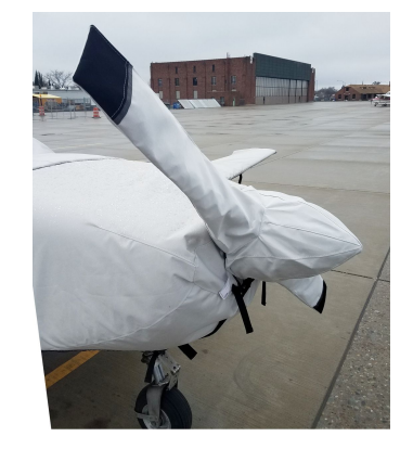
Glasair Aviation Glasair II & III Propellor/Spinner Cover, 2 Blade

This cover type is made from Silver Acrylic Sunbrella canvas and is 100% lined with a soft and smooth microfiber. Bruce's Custom Covers developed this material combination especially for aircraft protection. The outer material is medium weight and treated for water resistance, UV resistance and anti-static buildup. The inner lining is a very soft and smooth microfiber to prevent scratching. The material is very reflective, and tests show that the cabin interior temperature can be reduced to near-ambient temperature on the hottest of days. It is water, ice and snow repellent, yet breathable to allow moisture to escape from between the cover and the aircraft surface.