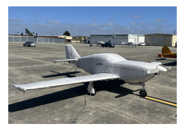
Glasair II Complete Cover Set

This cover type is made from Silver Acrylic Sunbrella canvas and is 100% lined with a soft and smooth microfiber. Bruce's Custom Covers developed this material combination especially for aircraft protection. The outer material is medium weight and treated for water resistance, UV resistance and anti-static buildup. The inner lining is a very soft and smooth microfiber to prevent scratching. The material is very reflective, and tests show that the cabin interior temperature can be reduced to near-ambient temperature on the hottest of days. It is water, ice and snow repellent, yet breathable to allow moisture to escape from between the cover and the aircraft surface.