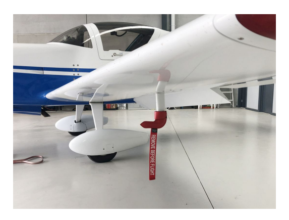
Glasair 2 Pitot Cover