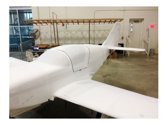
Glasair 2 Complete Fuselage/Wings Cover, test fit cover