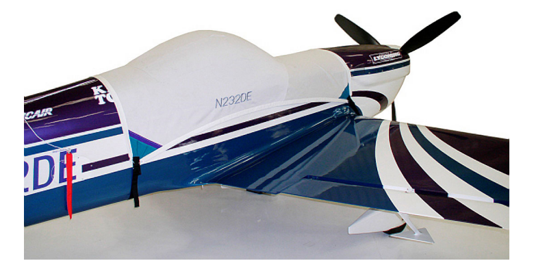
Cap 232 Canopy Cover