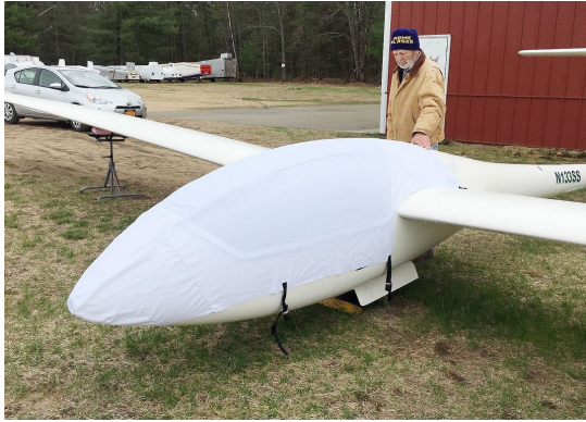
Grob 102 Astir CS Canopy/Nose Cover (test fit)