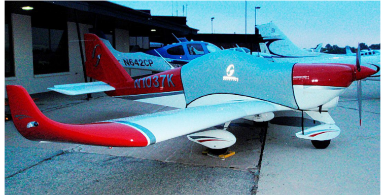
Gobosh Light Weight Travel-Cover