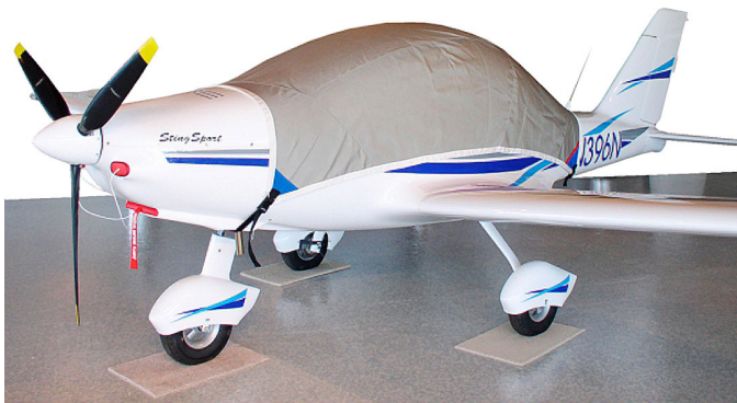
Sting Sport Canopy Cover & Engine Plugs

This cover type is made from Silver Acrylic Sunbrella canvas and is 100% lined with a soft and smooth microfiber. Bruce's Custom Covers developed this material combination especially for aircraft protection. The outer material is medium weight and treated for water resistance, UV resistance and anti-static buildup. The inner lining is a very soft and smooth microfiber to prevent scratching. The material is very reflective, and tests show that the cabin interior temperature can be reduced to near-ambient temperature on the hottest of days. It is water, ice and snow repellent, yet breathable to allow moisture to escape from between the cover and the aircraft surface.