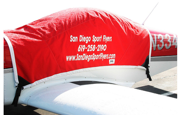
Gobosh Canopy Cover with custom Imprint