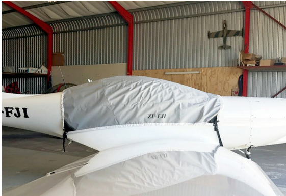
Gobosh 800XP Travel Cover, Light Weight Travel Canopy Cover

Travel Covers are made with Silver Solution-Dyed Polyester fabric and only lined over the windshield to save weight. The material is lightweight and more compact for easy stowage in the aircraft. The polyester material is water resistant, but only intended for occasional use outside. We also have an ultra lightweight material available for fitted hangar dust covers. For daily outdoor use, the non-travel Sunbrella Cover is the best choice.