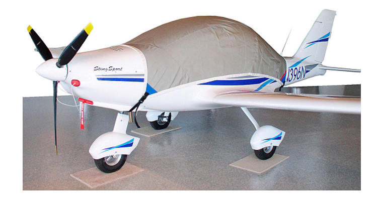
Sting Sport Canopy Cover & Engine Plugs