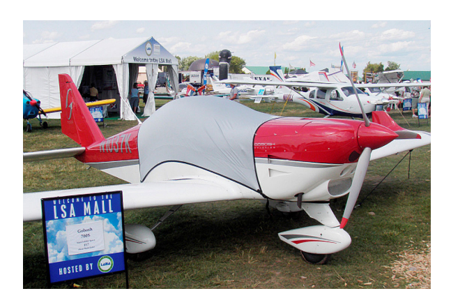
Gobosh GB7 Light Weight Travel-Cover