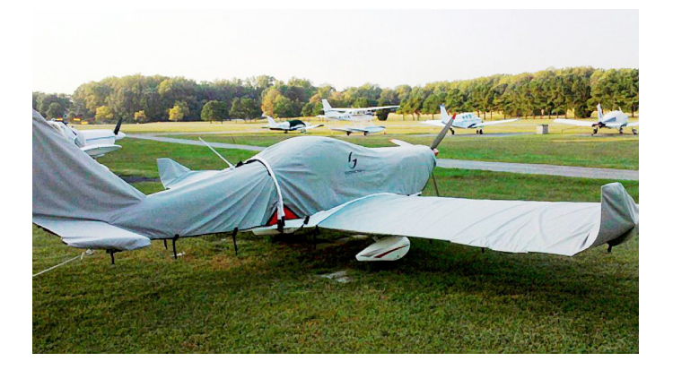
Gobosh Full Cover Set