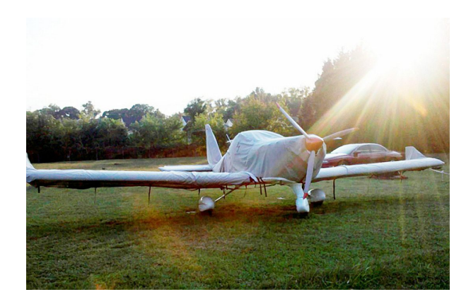
Gobosh Full Cover Set

WINTER USE MATERIAL - Made with Solution-Dyed Polyester fabric, this option is intended for seasonal use to aid in deicing, rain mitigation, or for occasional travel. The material is lighter and more compact, but more susceptible to UV damage and may have a shorter useful life if used continuously outside than the all-year use material.