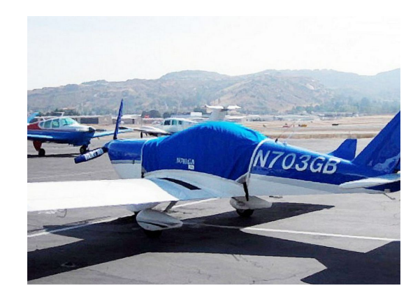
Gobosh 700S Canopy Cover (comes in colors)

This cover type is made from Silver Acrylic Sunbrella canvas and is 100% lined with a soft and smooth microfiber. Bruce's Custom Covers developed this material combination especially for aircraft protection. The outer material is medium weight and treated for water resistance, UV resistance and anti-static buildup. The inner lining is a very soft and smooth microfiber to prevent scratching. The material is very reflective, and tests show that the cabin interior temperature can be reduced to near-ambient temperature on the hottest of days. It is water, ice and snow repellent, yet breathable to allow moisture to escape from between the cover and the aircraft surface.