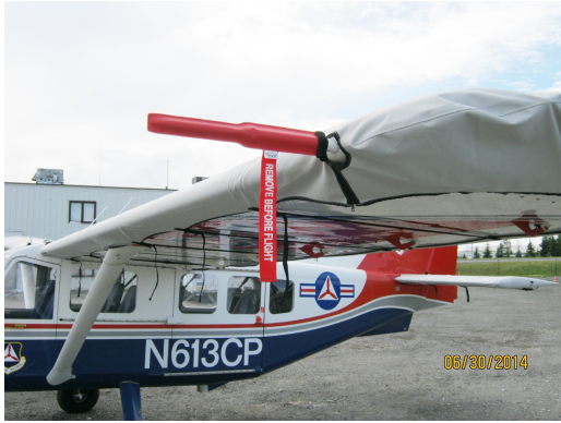
Gippsland GA-8 Airvan Wing Covers, Pitot Cover

shorter useful life if used continuously outside than the all-year use material.