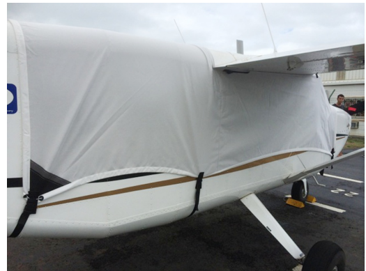
Gippsland GA-8 Airvan Canopy Cover