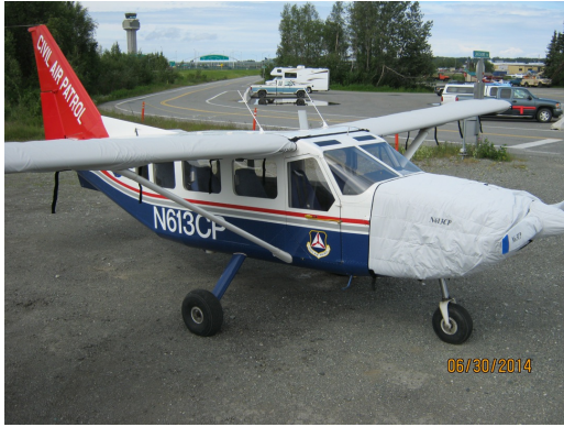
Gippsland GA-8 Airvan Insulated Engine, Wing and Prop Covers

shorter useful life if used continuously outside than the all-year use material.