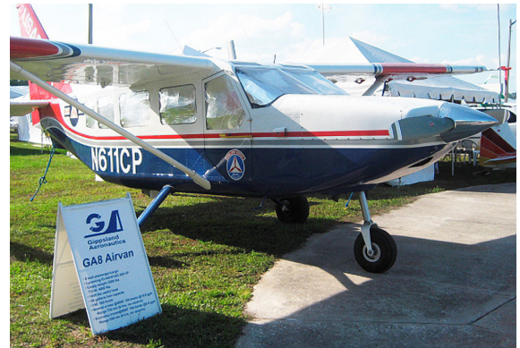
Gippsland GA-8 Airvan Cockpit & Cabin HeatShield Set