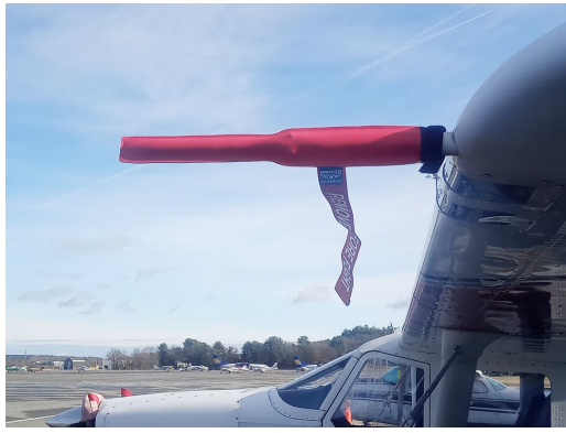
Gippsland GA-8 Airvan Pitot Cover