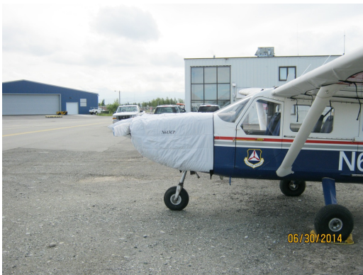
Gippsland GA-8 Airvan Insulated Engine and Prop Covers

This cover type is made from Silver Acrylic Sunbrella canvas and is 100% lined with a soft and smooth microfiber. Bruce's Custom Covers developed this material combination especially for aircraft protection. The outer material is medium weight and treated for water resistance, UV resistance and anti-static buildup. The inner lining is a very soft and smooth microfiber to prevent scratching. The material is very reflective, and tests show that the cabin interior temperature can be reduced to near-ambient temperature on the hottest of days. It is water, ice and snow repellent, yet breathable to allow moisture to escape from between the cover and the aircraft surface.