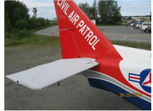
Gippsland GA-8 Airvan Horizontal Stab. Cover