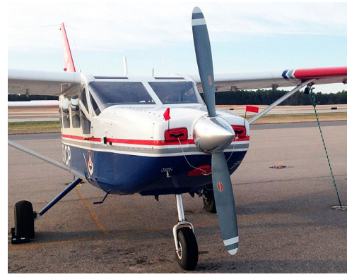
GA-8 Engine Inlet Plugs (set of 3)