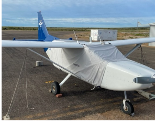
Gippsland GA-8 Extended Canopy Cover

This cover type is made from Silver Acrylic Sunbrella canvas and is 100% lined with a soft and smooth microfiber. Bruce's Custom Covers developed this material combination especially for aircraft protection. The outer material is medium weight and treated for water resistance, UV resistance and anti-static buildup. The inner lining is a very soft and smooth microfiber to prevent scratching. The material is very reflective, and tests show that the cabin interior temperature can be reduced to near-ambient temperature on the hottest of days. It is water, ice and snow repellent, yet breathable to allow moisture to escape from between the cover and the aircraft surface.