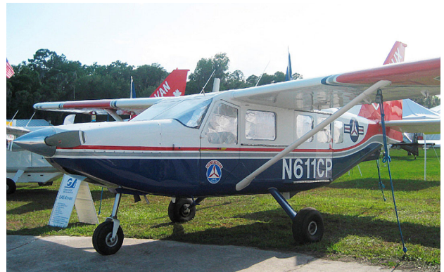
Gippsland GA-8 Airvan Cockpit & Cabin HeatShield Set