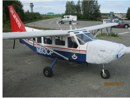
Gippsland GA-8 Airvan Insulated Engine, Wing and Prop Covers