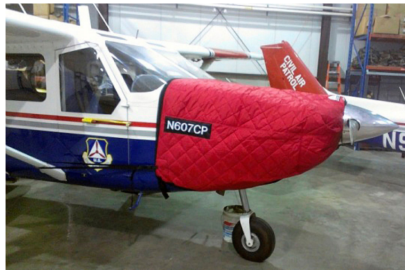
GA-8 Insulated Engine Cover