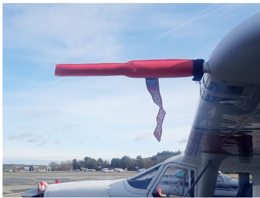
Gippsland GA-8 Airvan Pitot Cover