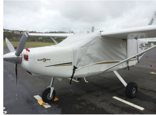
Gippsland GA-8 Airvan Canopy Cover