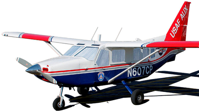
Covers, Plugs & HeatShields for the Gippsland GA-8 Airvan

Cockpit Heatshields are interior sunshades for the aircraft's cockpit. The product is a unique composite of closed-cell foam with a silver mylar finish. The semi-rigid design is stiff enough to stand inside the window framing. The set folds up flat and is easily stored in the included storage sleeve. Some designs may require velcro and suction cups. A Heatshield is an excellent short-term remedy for cockpit overheating, but an external fabric cover is more effective for long-term protection.