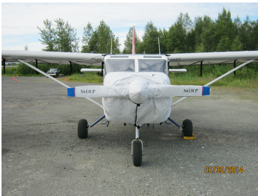
Gippsland GA-8 Airvan Insulated Engine and Prop Covers

This cover type is made from Silver Acrylic Sunbrella canvas and is 100% lined with a soft and smooth microfiber. Bruce's Custom Covers developed this material combination especially for aircraft protection. The outer material is medium weight and treated for water resistance, UV resistance and anti-static buildup. The inner lining is a very soft and smooth microfiber to prevent scratching. The material is very reflective, and tests show that the cabin interior temperature can be reduced to near-ambient temperature on the hottest of days. It is water, ice and snow repellent, yet breathable to allow moisture to escape from between the cover and the aircraft surface.