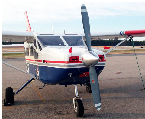
GA-8 Engine Inlet Plugs (set of 3)