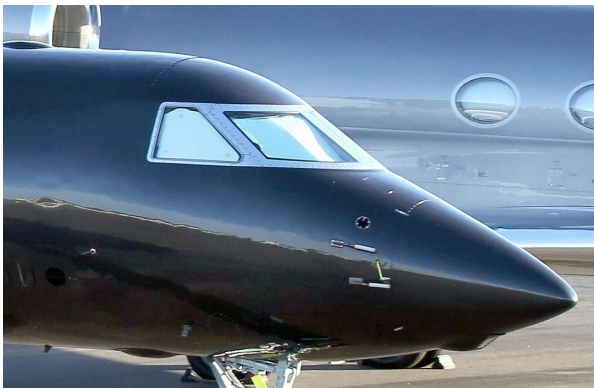
Gulfstream Cockpit Heatshields

Cockpit Heatshields are interior sunshades for the aircraft's cockpit. The product is a unique composite of closed-cell foam with a silver mylar finish. The semi-rigid design is stiff enough to stand inside the window framing. The set folds up flat and is easily stored in the included storage sleeve. Some designs may require velcro and suction cups. Our Heatshields for jets are offered white side out because some aircraft manufacturers have issued advisories against reflective window inserts due to potential heat damage. A Heatshield is an excellent short-term remedy for cockpit overheating, but an external fabric cover is more effective for long-term protection.