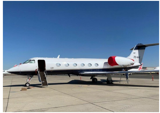
Grumman Gulfstream G-IV SP Engine Cover, bikini type