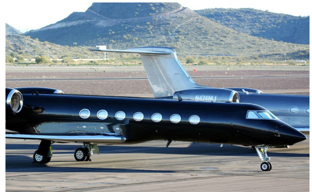
Gulfstream Cockpit Heatshields