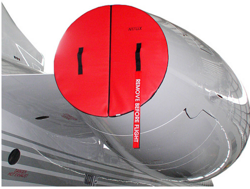
Global Express Exhaust Plugs