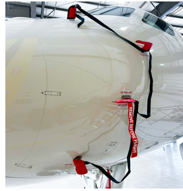
Gulfstream GVII Pitot Probes/TAT/Ice Detector Set, Heat Resistant Type