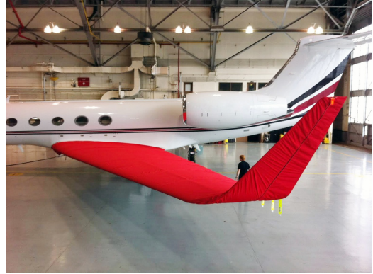
Gulfstream G550 Wing/Winglet Covers