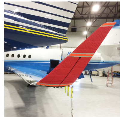
Falcon 2000 Winglet Pad