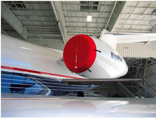
Gulfstream GVII-G600 Intake Covers