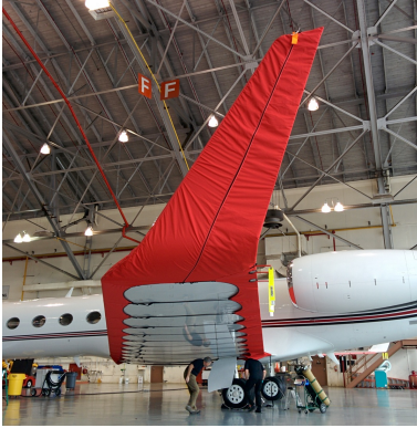
Gulfstream G550 Wing/Winglet Covers

WINTER USE MATERIAL - Made with Solution-Dyed Polyester fabric, this option is intended for seasonal use to aid in deicing, rain mitigation, or for occasional travel. The material is lighter and more compact, but more susceptible to UV damage and may have a shorter useful life if used continuously outside than the all-year use material.