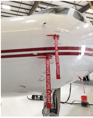
Grumman Gulfstream G-V Pitot Covers