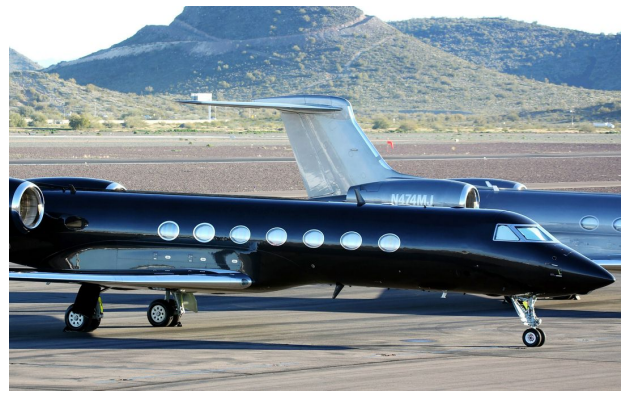
Gulfstream Cockpit Heatshields