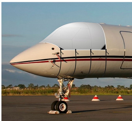
G-V Cockpit/Windshield Cover (Illustration)

Travel Covers are made with Silver Solution-Dyed Polyester fabric and only lined over the windshield to save weight. The material is lightweight and more compact for easy stowage in the aircraft. The polyester material is water resistant, but only intended for occasional use outside. We also have an ultra lightweight material available for fitted hangar dust covers. For daily outdoor use, the non-travel Sunbrella Cover is the best choice.