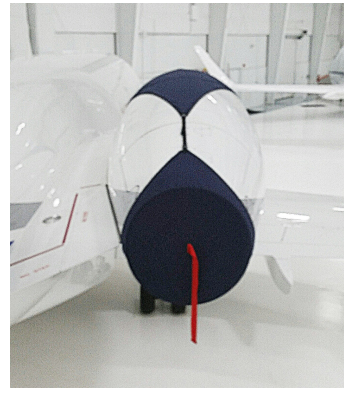
Challenger 300 Intake/Exhaust Cover Set, 3-strap type