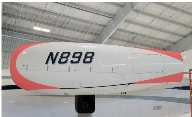
Gulfstream Aerospace G-IV (G350), Intake/Exhaust Cover, test fit cover

The Gulfstream Aerospace Gulfstream IV (C-20G), G350, G450 Intake Covers are designed to install easily yet be completely storable. A spring steel hoop is sewn into the hem of each cover, allowing them to be installed without climbing onto the wing or using a stepladder. To store the covers the spring steel hoop folds like a band-saw blade into three nesting rings. Each cover folds into a compact circular bundle which is stored in the included duffle bag, yet they unfold quickly for use. The Tri-Fold Ring cover is made of medium weight nylon which is available in a variety of colors to match the paint trim. Each cover set comes complete with installation and folding instructions. The aircraft's registration number can be silkscreened onto the cover for an extra charge.