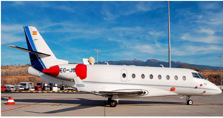
Gulfstream 200 Engine Cover set