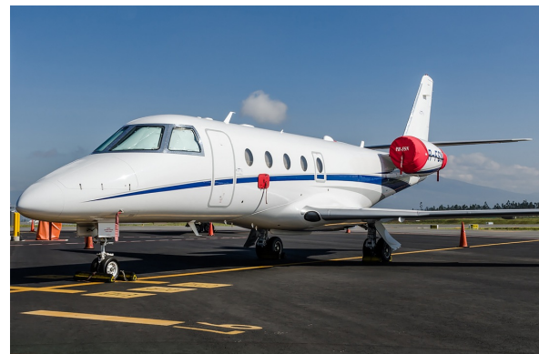
Gulfstream G150 Engine Covers, Cockpit HeatShields