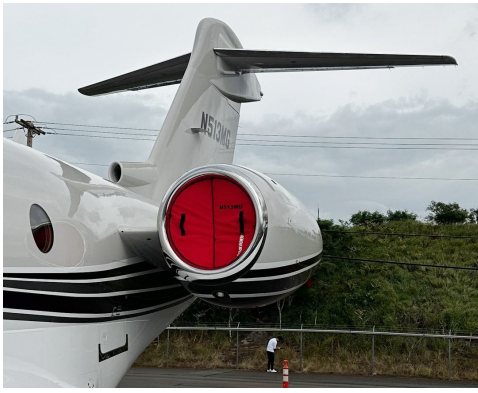
Gulfstream G280 Intake Plugs