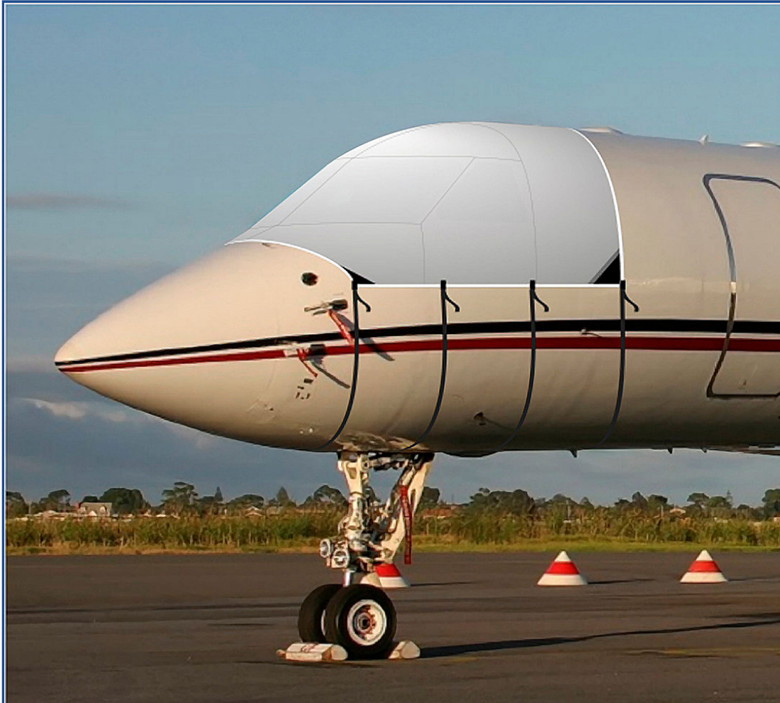
G-V Cockpit/Windshield Cover (Illustration)