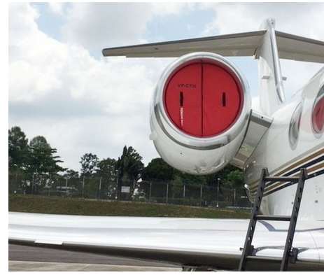
Grumman Gulfstream G450 Intake Plugs