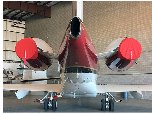
Canadair Challenger 300 Intake/Exhaust Covers, 3-Strap Type