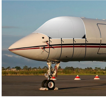
G-V Cockpit/Windshield Cover (Illustration)

the hottest of days. It is water, ice and snow repellent, yet breathable to allow moisture to escape from between the cover and the aircraft surface.