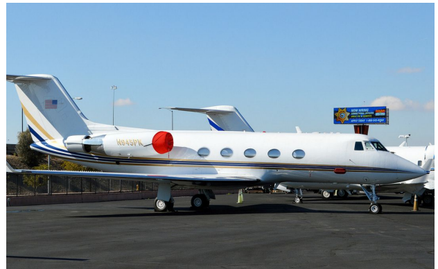
Grumman Gulfstream II Intake Covers