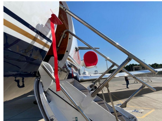
Grumman Gulfstream G-IV SP Pitot Cover