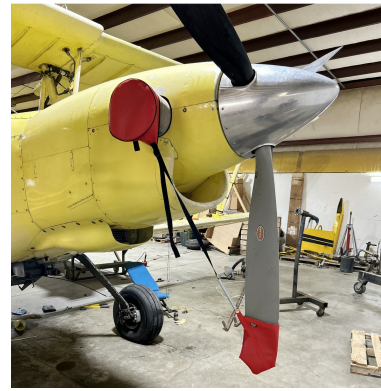
Schweizer Ag-Cat Prop Tie/Exhaust Cover Set