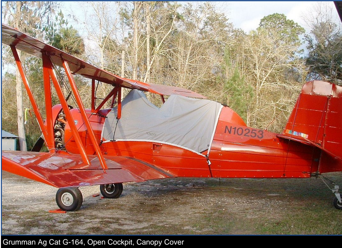
Grumman Ag Cat G-164, Open Cockpit, Canopy Cover