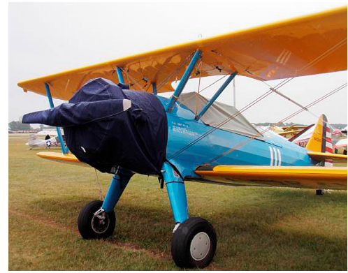
Stearman PT-13 Engine Cover