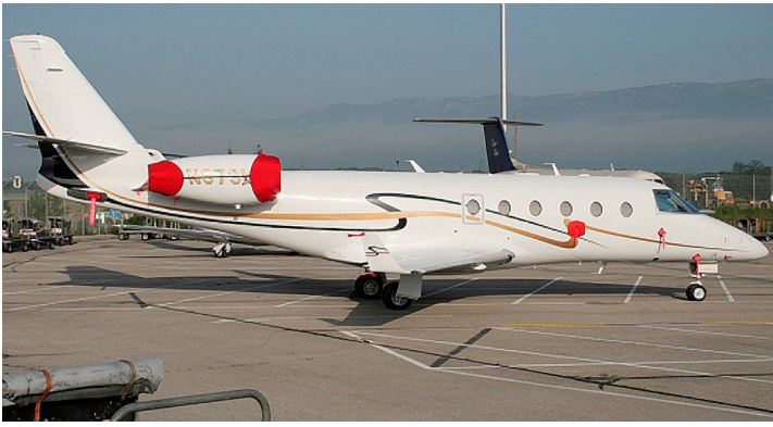
Engine Cover Set