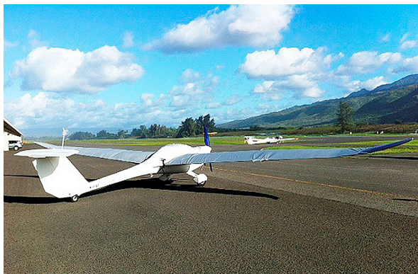
Lambda Canopy/Engine Cover and Wing Covers