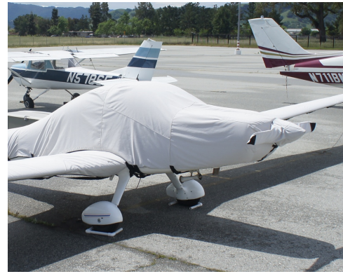
Grob 109 Prop Cover