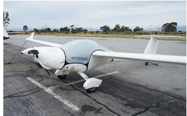
Lambda Canopy Cover