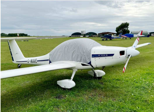
Grob 109 Travel Cover, Light Weight Canopy Cover