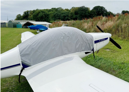
Grob 109 Travel Cover, Light Weight Canopy Cover