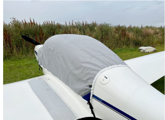
Grob 109 Travel Cover, Light Weight Canopy Cover