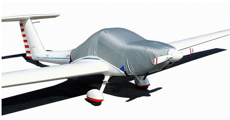
Grob 109 Canopy/Engine Cover