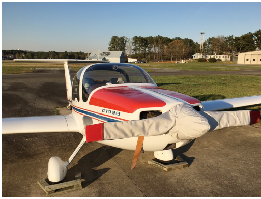
Grob 109 Prop Cover