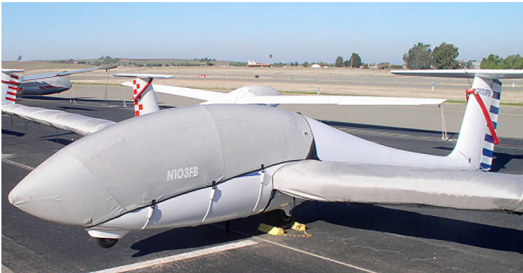
Grob 103 Canopy/Nose Cover and Wing Covers