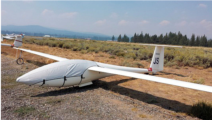
ASW-20C Canopy/Nose Cover

This cover type is made from Silver Acrylic Sunbrella canvas and is 100% lined with a soft and smooth microfiber. Bruce's Custom Covers developed this material combination especially for aircraft protection. The outer material is medium weight and treated for water resistance, UV resistance and anti-static buildup. The inner lining is a very soft and smooth microfiber to prevent scratching. The material is very reflective, and tests show that the cabin interior temperature can be reduced to near-ambient temperature on the hottest of days. It is water, ice and snow repellent, yet breathable to allow moisture to escape from between the cover and the aircraft surface.