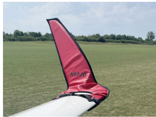
Schempp-Hirth Ventus-2B winglet/wingtip pads