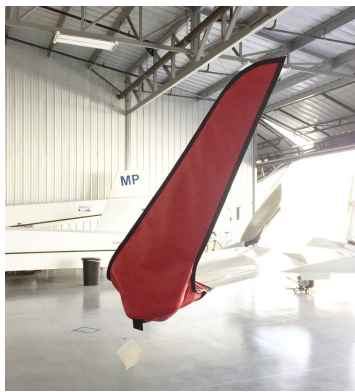
Schleicher ASH Wingtip Pads