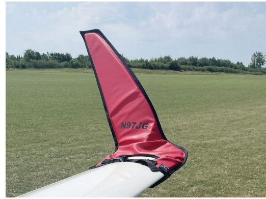
Schempp-Hirth Ventus-2B winglet/wingtip pads