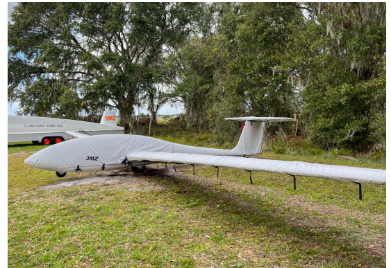
Burkhart Grob G 103 TWIN II Complete Cover Set