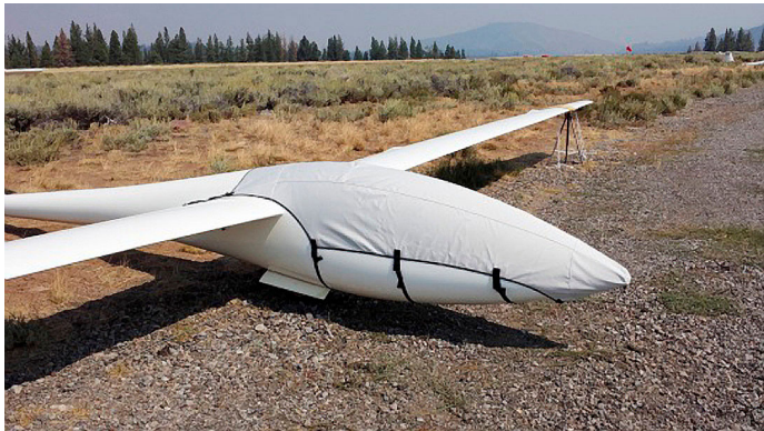
ASW-20C Canopy/Nose Cover

This cover type is made from Silver Acrylic Sunbrella canvas and is 100% lined with a soft and smooth microfiber. Bruce's Custom Covers developed this material combination especially for aircraft protection. The outer material is medium weight and treated for water resistance, UV resistance and anti-static buildup. The inner lining is a very soft and smooth microfiber to prevent scratching. The material is very reflective, and tests show that the cabin interior temperature can be reduced to near-ambient temperature on the hottest of days. It is water, ice and snow repellent, yet breathable to allow moisture to escape from between the cover and the aircraft surface.