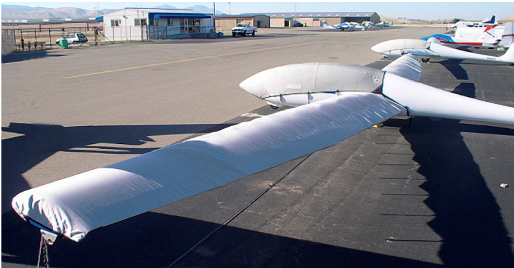
Grob 103 Canopy/Nose Cover and Wing Covers