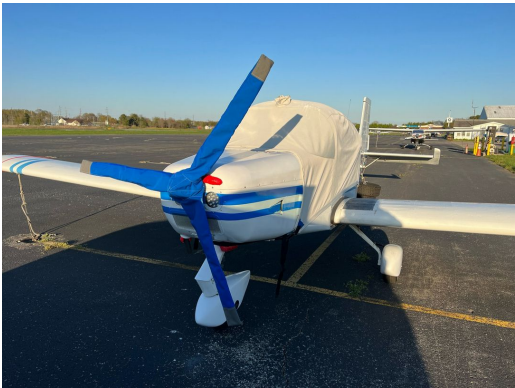
S C Aerostar Festival Prop Cover, Extended Canopy Cover