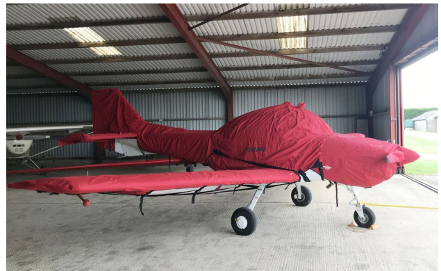
FLS Club Sprint Extended Canopy Cover