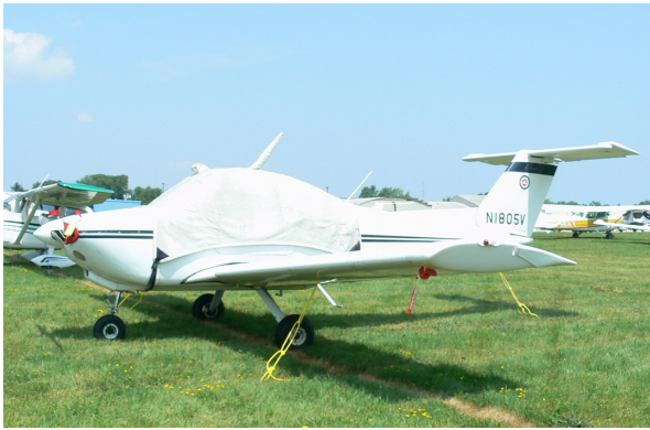
Beech Skipper Canopy Cover, Engine Plugs

Covers developed this material combination especially for aircraft protection. The outer material is medium weight and treated for water resistance, UV resistance and anti-static buildup. The inner lining is a very soft and smooth microfiber to prevent scratching. The material is very reflective, and tests show that the cabin interior temperature can be reduced to near-ambient temperature on the hottest of days. It is water, ice and snow repellent, yet breathable to allow moisture to escape from between the cover and the aircraft surface.