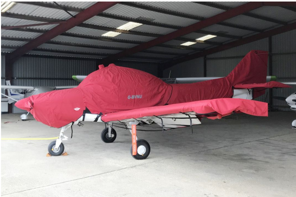
FLS Club Sprint Engine Cover

Covers developed this material combination especially for aircraft protection. The outer material is medium weight and treated for water resistance, UV resistance and anti-static buildup. The inner lining is a very soft and smooth microfiber to prevent scratching. The material is very reflective, and tests show that the cabin interior temperature can be reduced to near-ambient temperature on the hottest of days. It is water, ice and snow repellent, yet breathable to allow moisture to escape from between the cover and the aircraft surface.