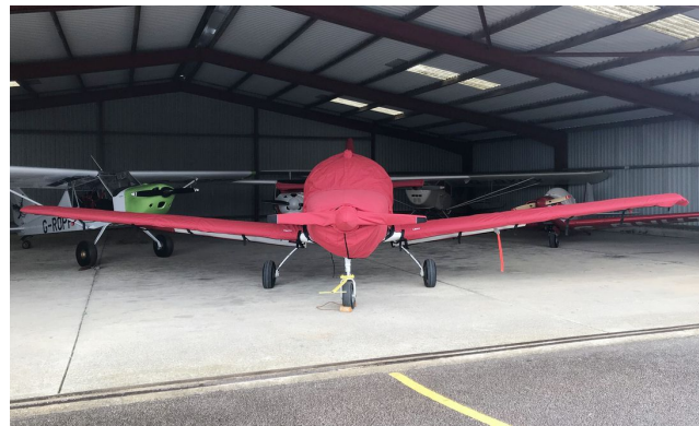
FLS Club Sprint Empennage Cover (Tailboom, Vertical & Horiz Stabilizers) All Year Use