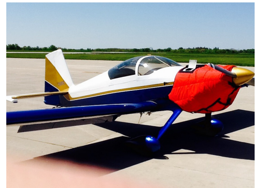
Van's RV-7 Insulated Engine Cover