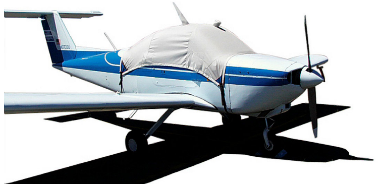
Canopy Cover for Beech Skipper