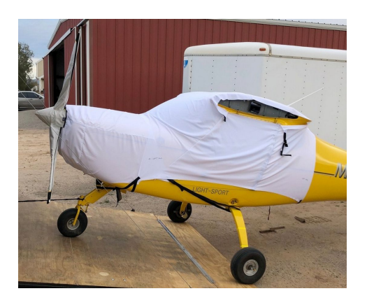
FK-Lightplanes FK-9 Canopy & Engine Covers, test fit covers

FK-Lightplanes FK-9 Canopy Cover, test fit cover