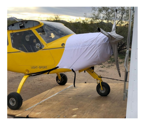
FK-9 Engine Cover, test fit cover

This cover type is made from Silver Acrylic Sunbrella canvas and is 100% lined with a soft and smooth microfiber. Bruce's Custom Covers developed this material combination especially for aircraft protection. The outer material is medium weight and treated for water resistance, UV resistance and anti-static buildup. The inner lining is a very soft and smooth microfiber to prevent scratching. The material is very reflective, and tests show that the cabin interior temperature can be reduced to near-ambient temperature on the hottest of days. It is water, ice and snow repellent, yet breathable to allow moisture to escape from between the cover and the aircraft surface.