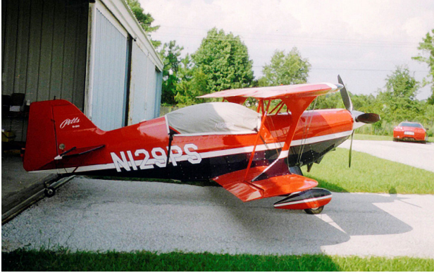
Pitts S2 Canopy Cover

This cover type is made from Silver Acrylic Sunbrella canvas and is 100% lined with a soft and smooth microfiber. Bruce's Custom Covers developed this material combination especially for aircraft protection. The outer material is medium weight and treated for water resistance, UV resistance and anti-static buildup. The inner lining is a very soft and smooth microfiber to prevent scratching. The material is very reflective, and tests show that the cabin interior temperature can be reduced to near-ambient temperature on the hottest of days. It is water, ice and snow repellent, yet breathable to allow moisture to escape from between the cover and the aircraft surface.