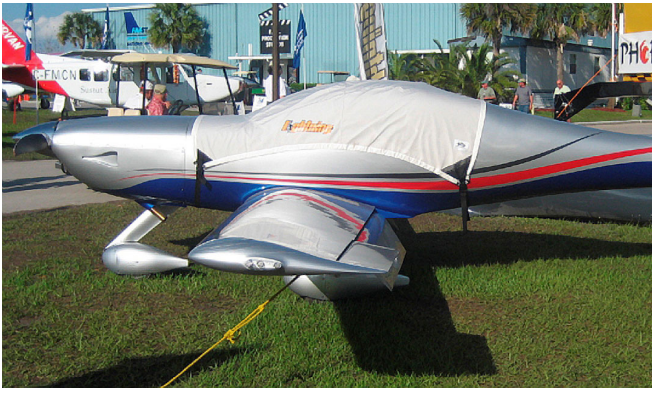
Lightning Canopy Cover