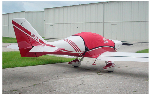
Lightning Canopy Cover