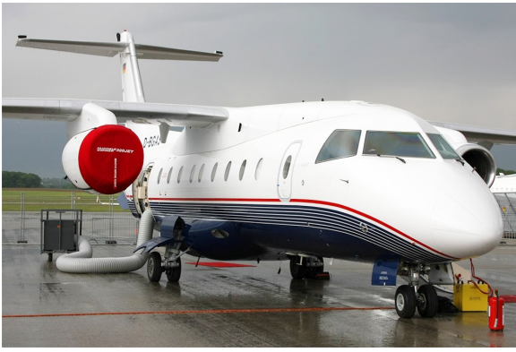
Fairchild/Dornier 328 Engine Covers