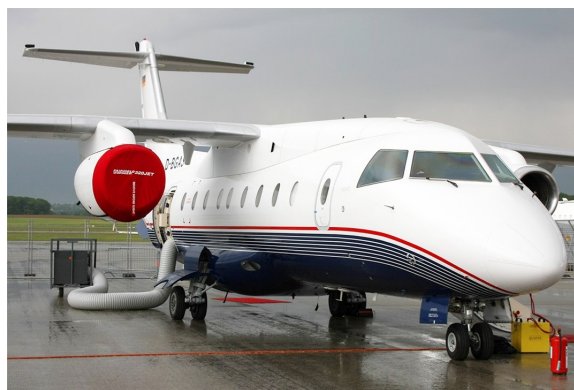
Fairchild/Dornier 328 Engine Covers