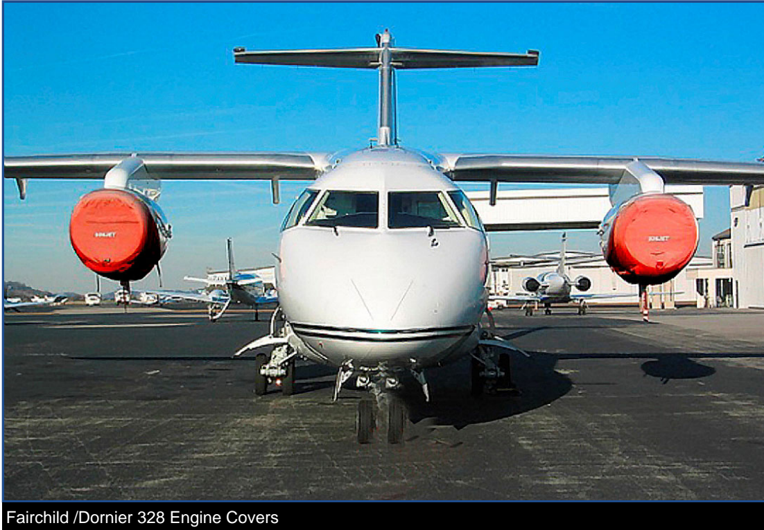
Fairchild /Dornier 328 Engine Covers