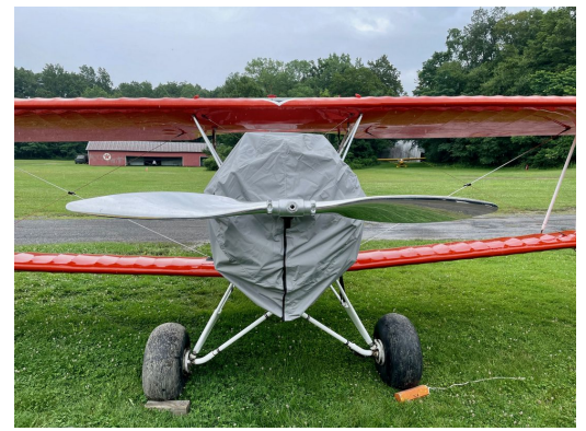
Fleet Biplane Model 1 Canopy & Engine Covers