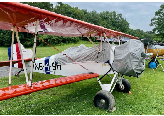
Fleet Biplane Model 1 Canopy & Engine Covers