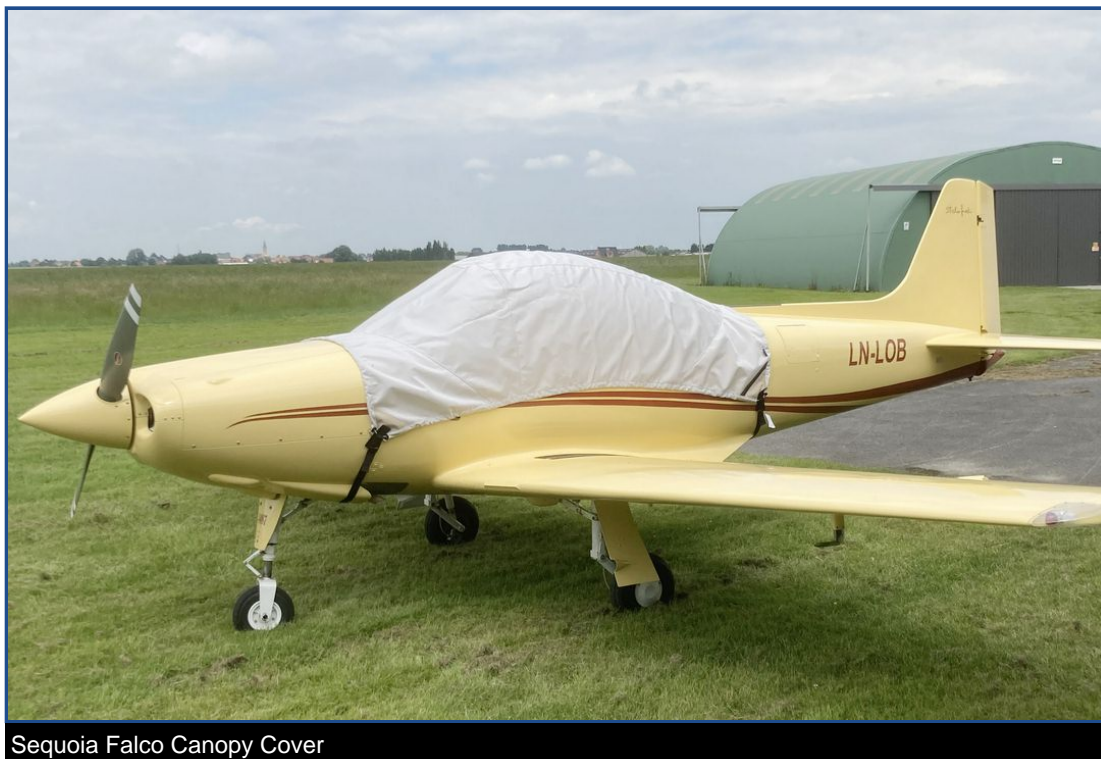
Sequoia Falco Canopy Cover