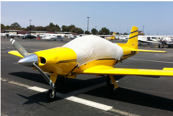
Falco Canopy Cover