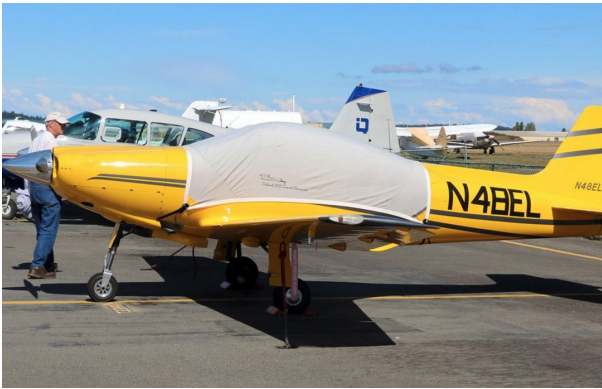
Sequoia Falco Travel Weight Canopy Cover

Travel Covers are made with Silver Solution-Dyed Polyester fabric and only lined over the windshield to save weight. The material is lightweight and more compact for easy stowage in the aircraft. The polyester material is water resistant, but only intended for occasional use outside. We also have an ultra lightweight material available for fitted hangar dust covers. For daily outdoor use, the non-travel Sunbrella Cover is the best choice.