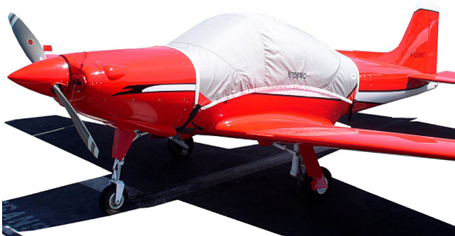
Falco Canopy Cover & Engine Plugs

This cover type is made from Silver Acrylic Sunbrella canvas and is 100% lined with a soft and smooth microfiber. Bruce's Custom Covers developed this material combination especially for aircraft protection. The outer material is medium weight and treated for water resistance, UV resistance and anti-static buildup. The inner lining is a very soft and smooth microfiber to prevent scratching. The material is very reflective, and tests show that the cabin interior temperature can be reduced to near-ambient temperature on the hottest of days. It is water, ice and snow repellent, yet breathable to allow moisture to escape from between the cover and the aircraft surface.