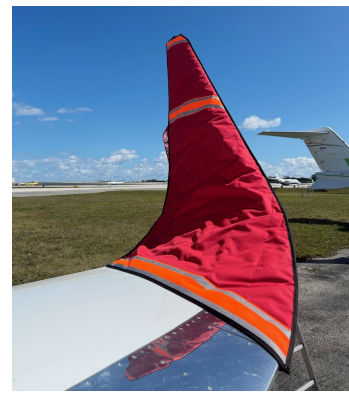
Falcon Jet 900 Winglet Padding Covers