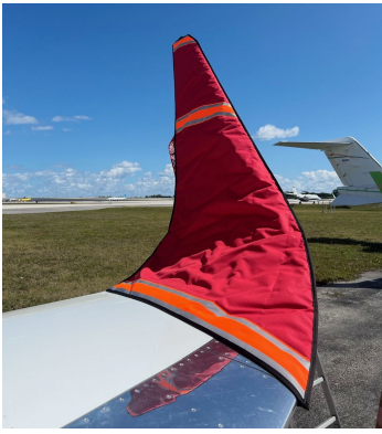
Falcon Jet 900 Winglet Padding Covers