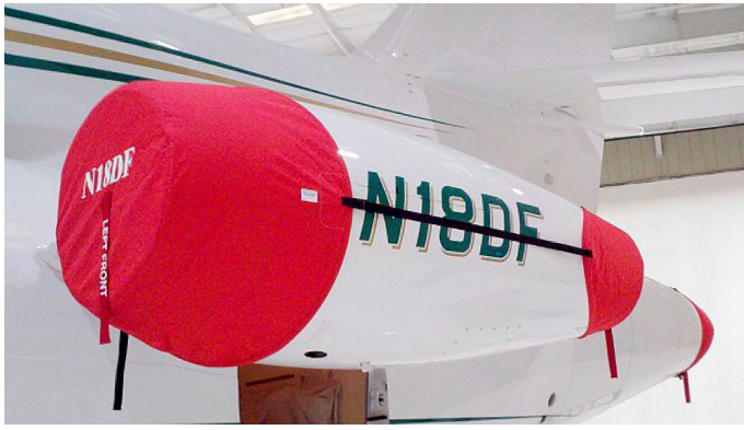
Falcon 900 Engine Cover Set