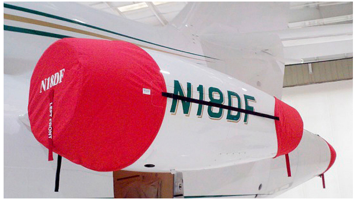
Falcon 900 Engine Cover Set