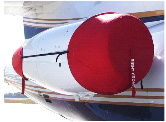
Falcon 50 Outboard Engine Cover